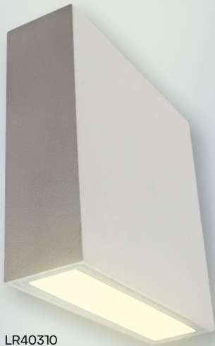
LR40310 WHITE FINISH