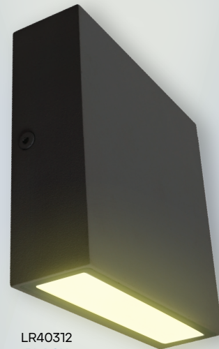
LR40312 BLACK FINISH