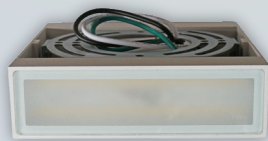
TOP & BOTTOM WITH LED BOARD AND DIFFUSER