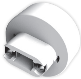
LR34139* OPTIONAL FA8/R17D PIN CONVERSION SET *SOLD SEPARATELY