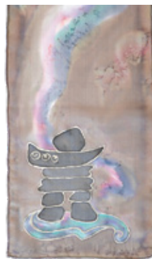
Desert Sand 596