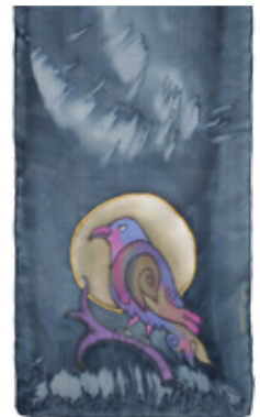
Steel Grey 648