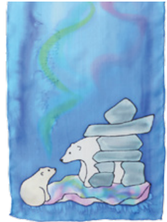
Blue Pearl 453