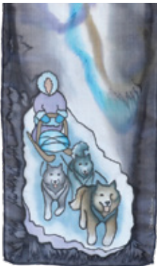
Lilac Grey 686