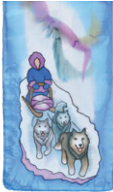
Blue Pearl 453