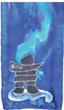
Monaco Blue 467