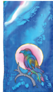
Dark French Blue 446