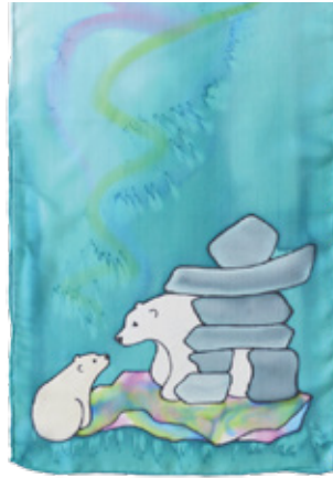
Lagoon Blue 745