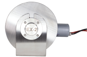
HERO EX-2 WINCH

The electronic fast fall system is the perfect compromise between fast direct drive and free-fall, doubling the speed of deployment from 100 feet per minute to 200 feet per minute, while still maintaining control of the drop speed.