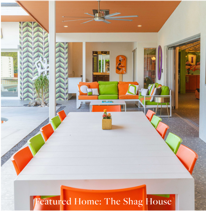
Featured Home: The Shag House