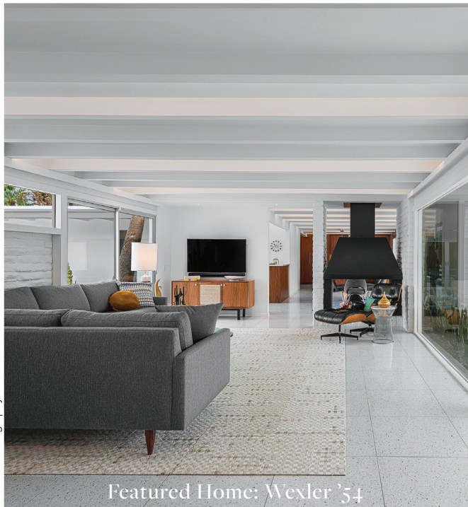
Featured Home: Wexler '54