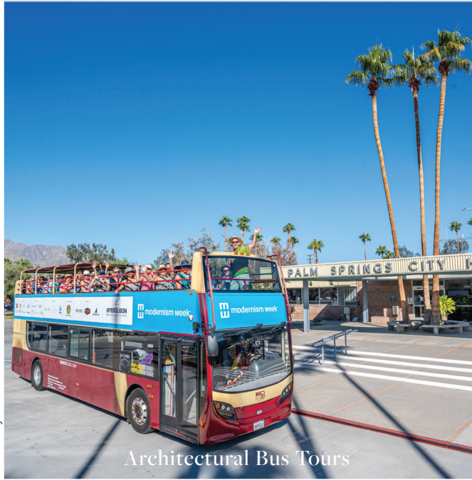
Architectural Bus Tours