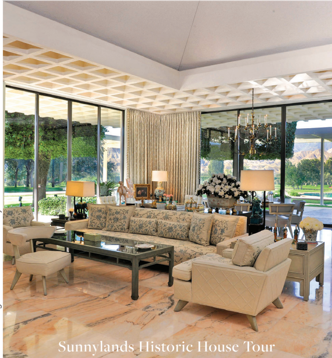
Sunnylands Historic House Tour

The Annenberg Foundation Trust at Sunnylands