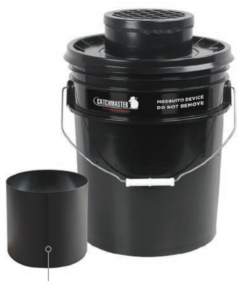
Replacement Glue Board designed to fit AGO traps

For best results, install the replacement glue board into an AGO trap. Intended for outdoor use where mosquito populations are prevelant. Compatible with Catchmaster Ovi-Catch™ Mosquito Trap, CDC-AGO Trap, and other similar traps.