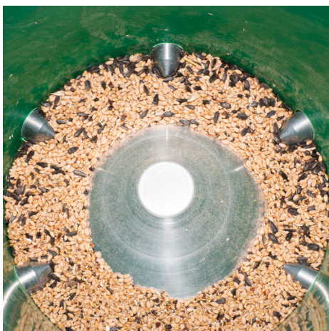
4. The feeder can now be filled with seed.

If you are retro-fitting the feeder cone then simply loosen of the wing nuts enough so that the ports can be withdrawn.