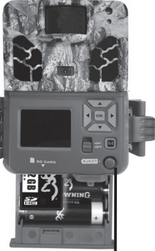
Battery Eject Button

Slide the battery tray into the closed position.