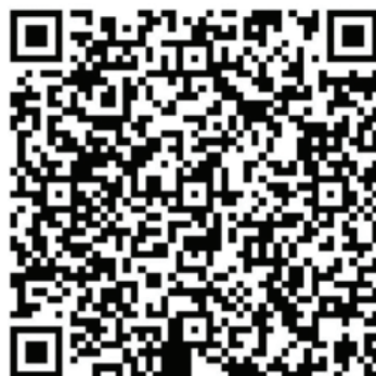
Iphone APP QR code