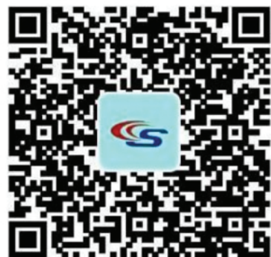
Overseas Android APP QR code