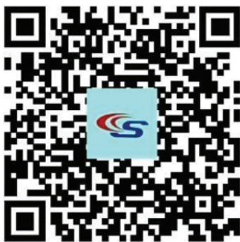
Android APP QR code