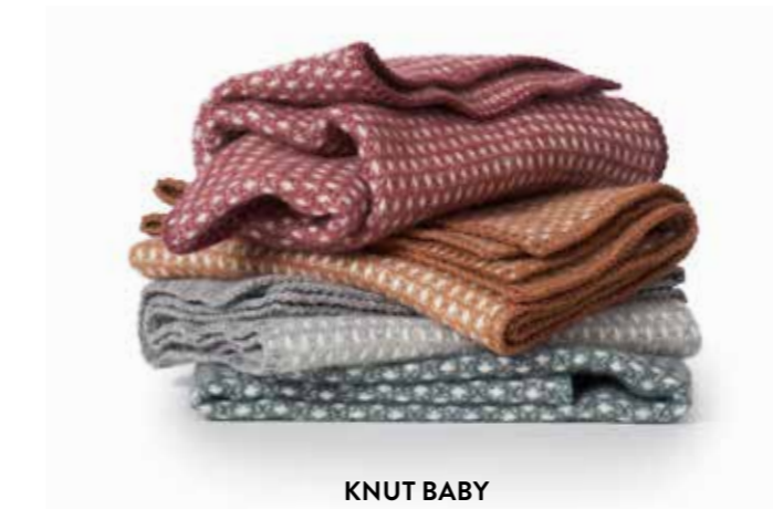
KNUT BABY 65 X 90 CM. 100 % ECO LAMBSWOOL 2316-04 Rose brown | -02 Nougat | -01 Light grey | -03 Balsam green