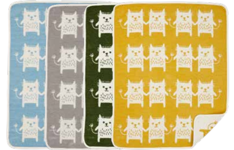
LITTLE ME by EDHOLM ULLENIUS 70 X 90 CM. 100 % ORGANIC COTTON CHENILLE 2538-04 Turquoise | -03 Grey | -02 Green | -01 Yellow