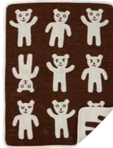
BRUNO by KARIN MANNERSTÅL 70 X 90 CM. 100 % ORGANIC COTTON CHENILLE 2502-13 Brown