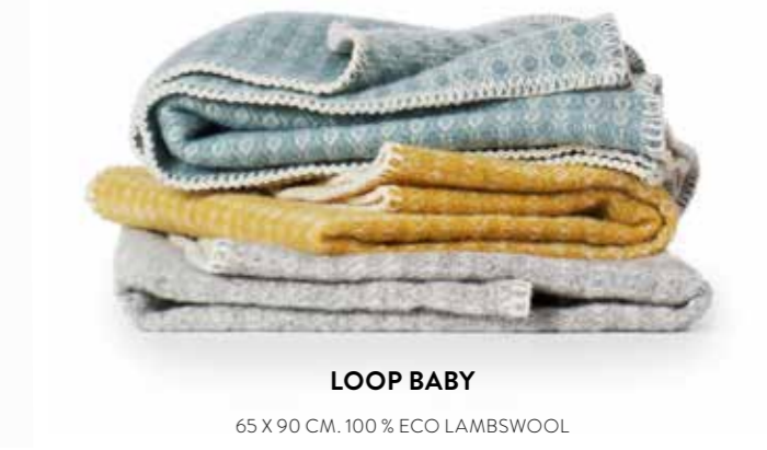
LOOP BABY 65 X 90 CM. 100 % ECO LAMBSWOOL 2315-02 Sky blue | -03 Mustard | -01 Stone