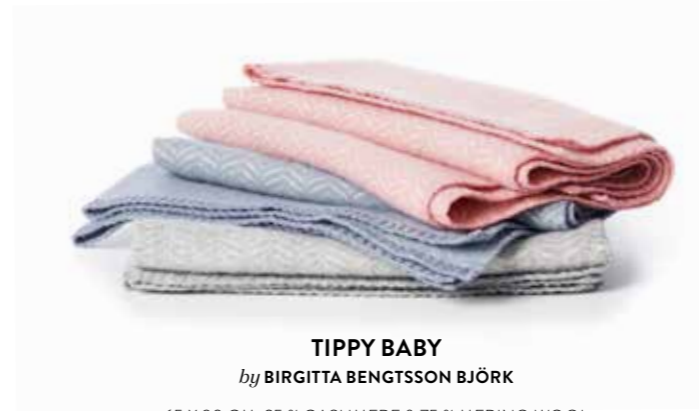
TIPPY BABY by BIRGITTA BENGSSON BJÖRK 65 X 90 CM. 25 % CASHMERE & 75 % MERINO WOOL 2313-02 Pink | -03 Blue | -01 Grey