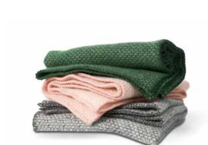
DOMINO BABY 65 X 90 CM. 100 % ECO LAMBSWOOL 2304-02 Green | -04 Pink | -01 Dark grey