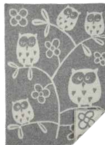
TREE OWL by BITTE STENSTRÖM 65 X 90 CM. 100 % ECO LAMBSWOOL 2422-01 Light grey