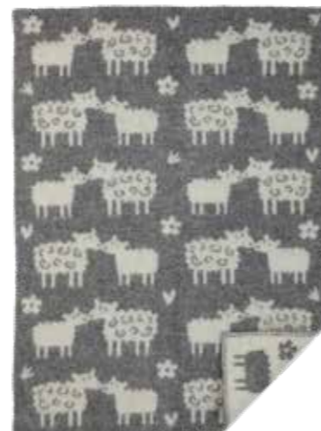
BÄÄ by BENG T & LOTTA 65 X 90 CM. 100 % ECO LAMBSWOOL 2424-01 Grey