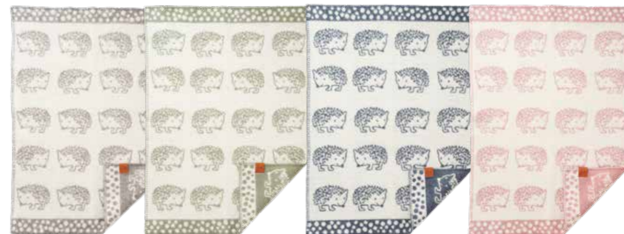
HEDGEHOG by BITTE STENSTRÖM 65 X 90 CM. 50 % RECYCLED WOOL, & 50 % ECO LAMBSWOOL 2465-01 Grey | -02 Green | -03 Blue | -04 Pink