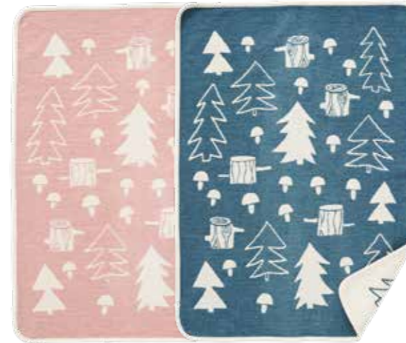
MUSHROOM by TINA BACKMAN 70 X 90 CM. 100 % ORGANIC COTTON CHENILLE 2567-02 Pink | -03 Blue