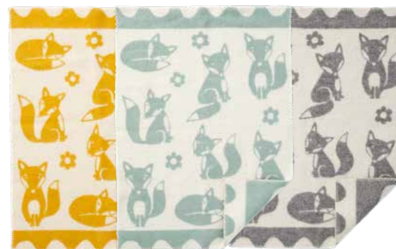
FOX by BITTE STENSTRÖM 65 X 90 CM. 100 % ECO LAMBSWOOL 2450-01 Saffron | -02 Duck egg blue | -03 Grey