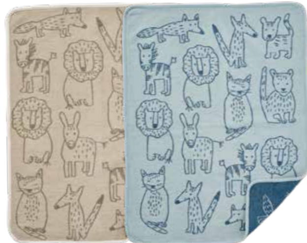
BUDDIES by BITTE STENSTRÖM 70 X 90 CM. 100 % ORGANIC COTTON CHENILLE 2568-01 Khaki | -02 Blue