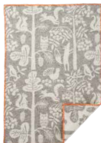
TREE CLIMBERS by BENG T & LOTTA 65 X 90 CM. 50 % RECYCLED WOOL & 50 % ECO LAMBSWOOL 2461-02 Grey