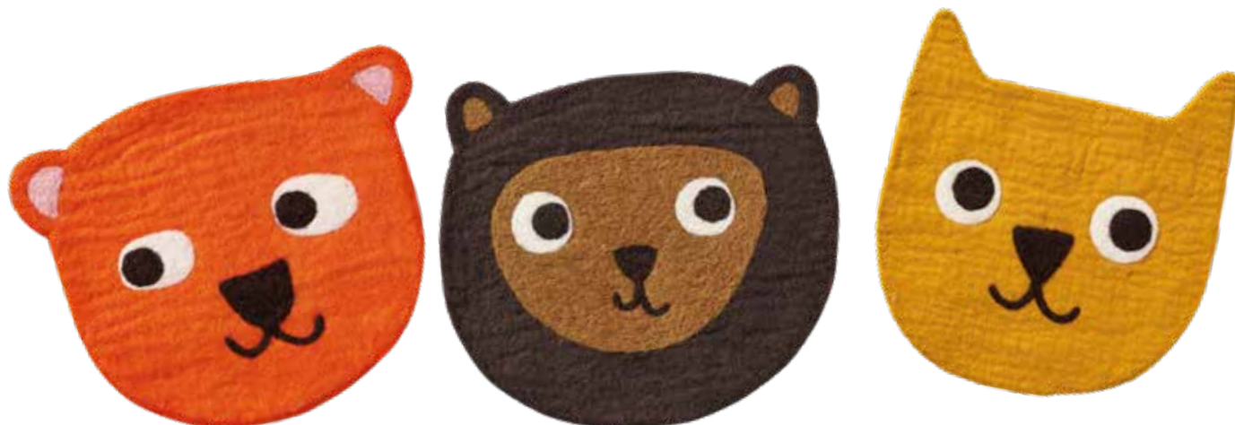
ART DIRECTION & STYLING: GABRIELLA AGNÉR / LILLA GUBBEN & PERNILLA ROOS

KLIPPAN YLLEFABRIK AB | PO. BOX 3 | 264 21 KLIPPAN | SWEDEN | PHONE: +46 435-44 88 80 | FAX: +46 435-44 88 88 | info@klippanyllefabrik.se | www.klippanyllefabrik.se