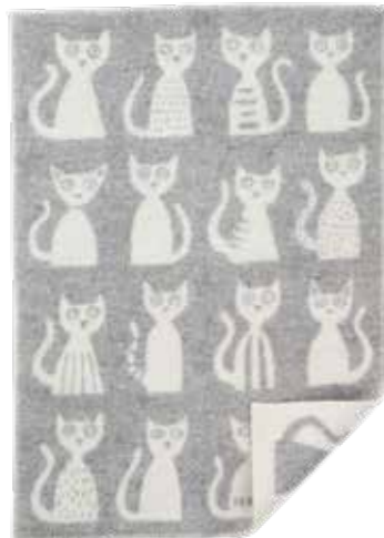
CAT by BENG T & LOTTA 65 X 90 CM. 100 % ECO LAMBSWOOL 2463-03 Grey