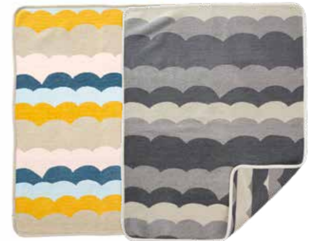
HILLS by TINA BACKMAN 70 X 90 CM. 100 % ORGANIC COTTON CHENILLE 2569-01 Multi | -02 Grey