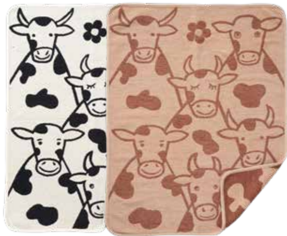
MUU by BITTE STENSTRÖM 70 X 90 CM. 100 % ORGANIC COTTON CHENILLE 2573-01 Black/white | -02 Beige/brown