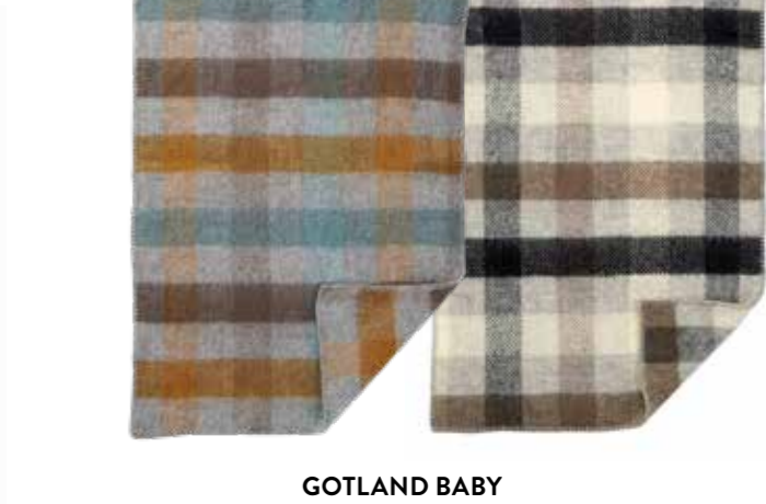
GOTLAND BABY 65 X 90 CM. 25 % GOTLAND WOOL & 75 % ECO LAMBSWOOL 2311-03 Multi turquoise | -01 Multi grey