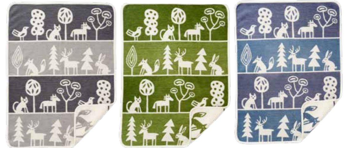
WILDLIFE by BENGT & LOTTA 70 X 90 CM. 100 % ORGANIC COTTON CHENILLE 2572-01 Grey | -02 Green | -03 Blue