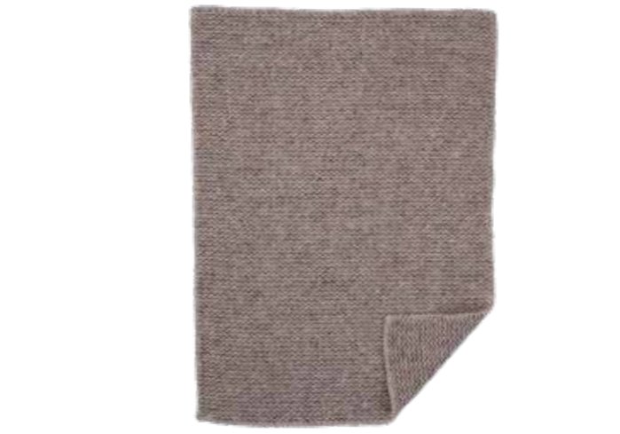
WAVE BABY 65 X 90 CM. 50 % RECYCLED WOOL & 50 % ECO LAMBSWOOL 2310-01 Natural brown