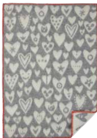
BABY HEART by BENG T & LOTTA 65 X 90 CM. 100 % ECO LAMBSWOOL 2408-01 Grey