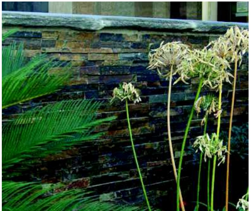
California Gold Ledger Panel