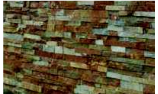
Golden White Ledger Panel

M S International's Natural Stone Ledger panels are trimmed pieces of natural ledger stone affixed together to form modular panels, which allows for the streamlined installation of dry stacked ledge stone veneer. M S International's natural stone veneer panels feature a unique joint design that becomes virtually undetectable after installation. We offer these panels in two styles: Natural stone ledger stepped panels and "L" ledger stepped panel corners for outside corner.