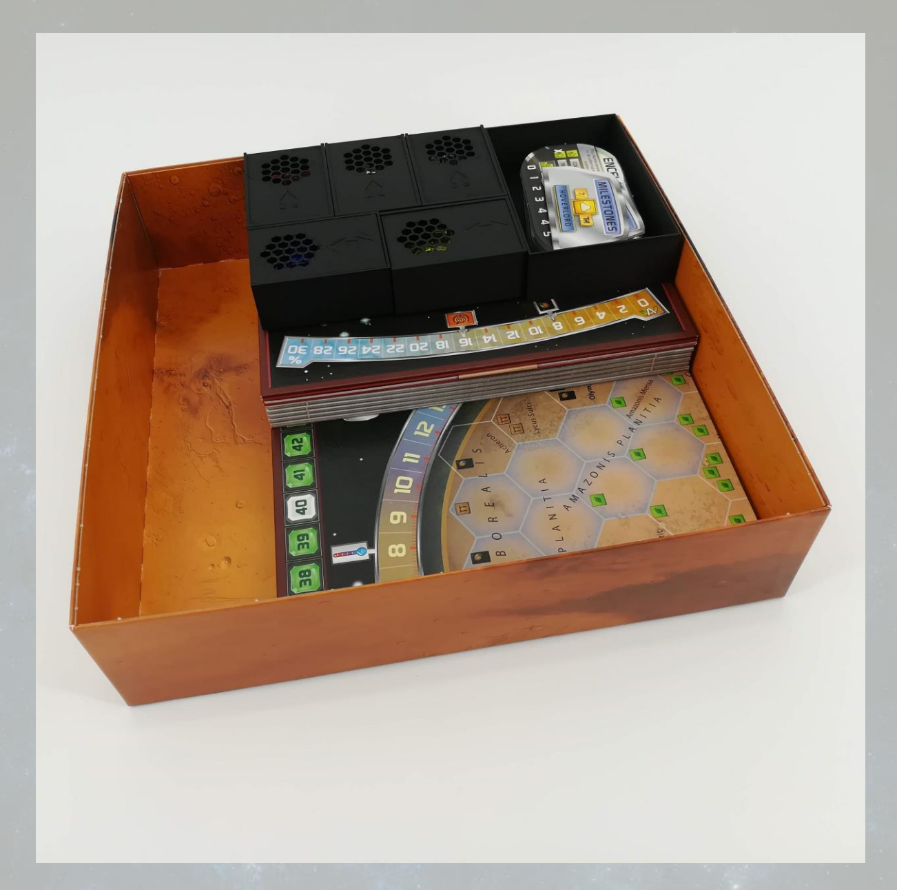
Component Storage #4

Place the Player Boxes on top of the Trade Fleets Tile