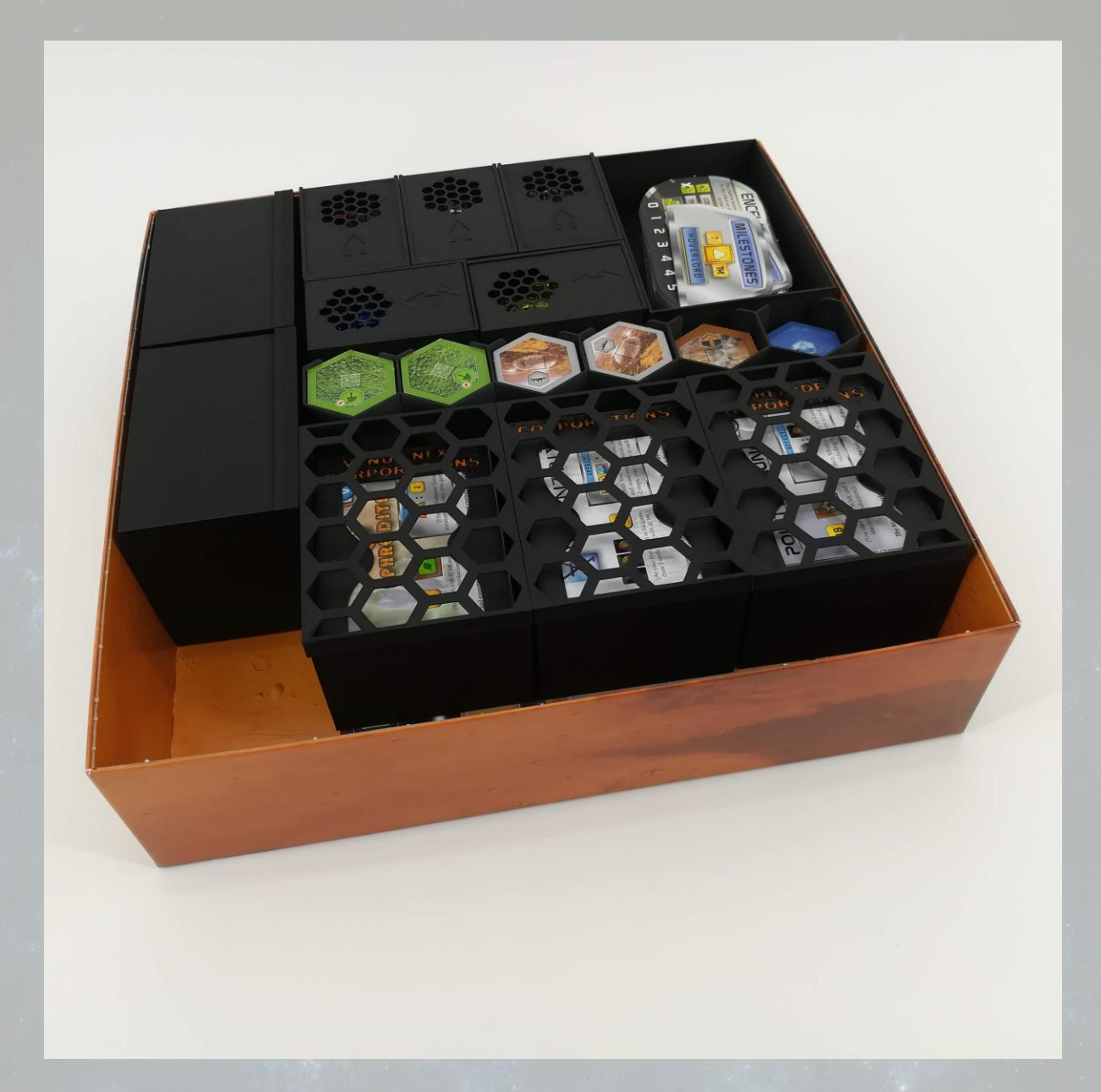
Component Storage #6

Place the two big Card Boxes on the side like shown in the picture.