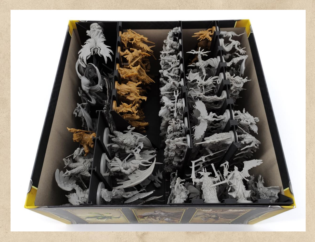
Component Storage #3