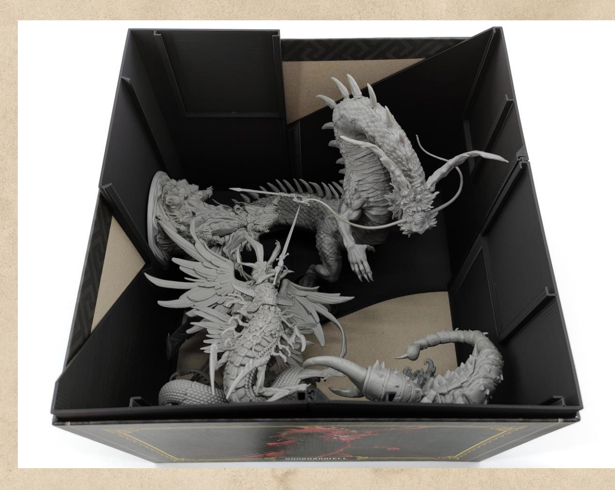
Component Storage #6

Scorpion King and Baalberith are the next miniatures.