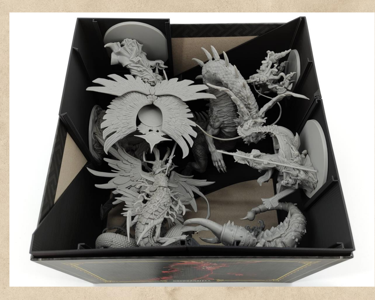
Component Storage #7

Now add Archangel Michael, Charon and Ghoul.