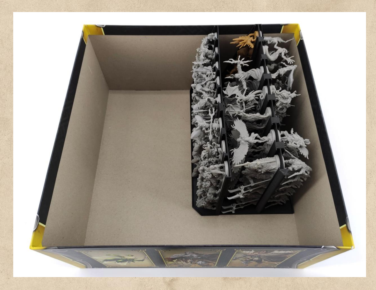
Component Storage #1

Start by placing #M1 and #M4 in the base game box.