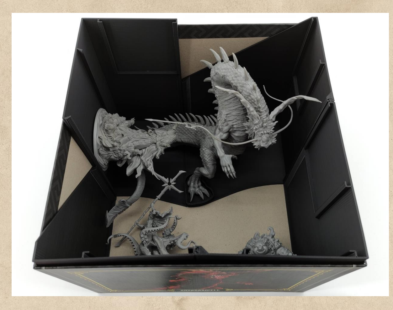
Component Storage #5