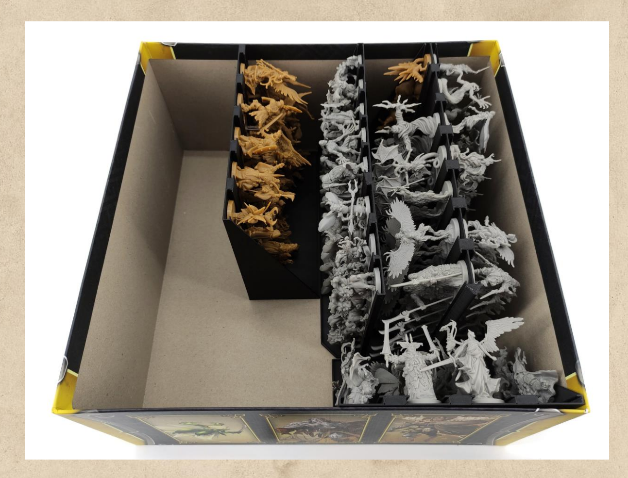
Component Storage #2