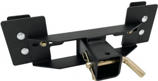
Installed with YardRack (YardRack not included)