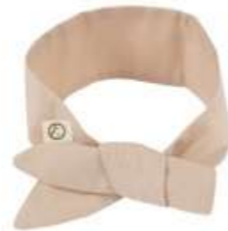
603UNP12-BZ HEADBAND - BEIGE STANDARD SIZE %100 ORGANIC COTTON FABRIC