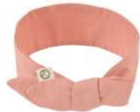
603UNP91-BZ HEADBAND- PINK STANDARD SIZE %100 ORGANIC COTTON FABRIC