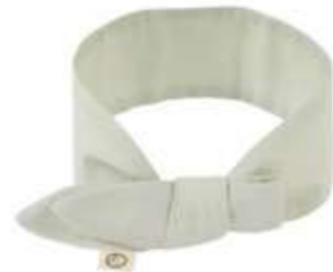
603UNP82-BZ HEADBAND - GREEN STANDARD SIZE %100 ORGANIC COTTON FABRIC