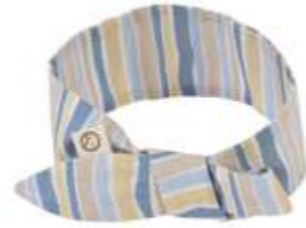
603LNB10-BZ HEADBAND - STRIPED PATTERNED BLUE STANDARD SIZE %100 ORGANIC COTTON FABRIC