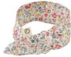
603FLA10-BZ HEADBAND - FLOWER PATTERNED STANDARD SIZE %100 ORGANIC COTTON FABRIC