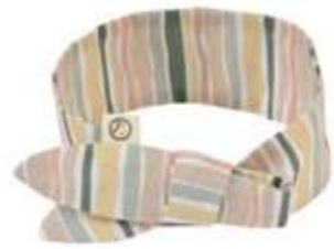
603LNA10-BZ HEADBAND - STRIPED PATTERNED GREEN STANDARD SIZE %100 ORGANIC COTTON FABRIC