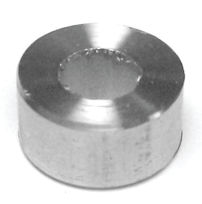
1/2" x 1/4" x 1/4" long spacer

NOTE: TO ORDER THE FASTENERS & SPACERS NEEDED FOR THE PROCEDURES SHOWN ON PAGES 2 & 3, ORDER MOUNTING KIT, PART NO. 190-0036. EACH KIT CONTAINS THE PARTS NEEDED TO MOUNT ONE BBQ (FRONT & REAR) TO A CART.