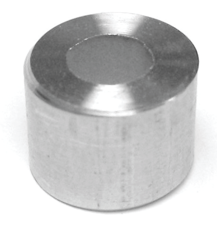
1/2" x 1/4" x 3/8" long spacer

Note: Failure to use these spacers will cause the barbeque to be inadequately secured to the cart. Over tightening of the mounting screws without the use of these spacers will damage either the barbeque, the cart or both.