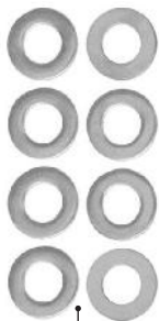
M8 Flat Washer