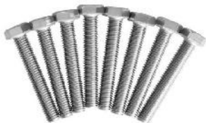
M8X50 Hex Head Bolt