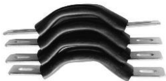
Rubber Coated U-Mount