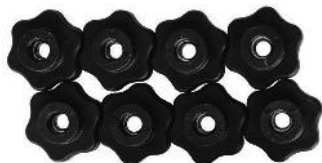
Star Knob with M8 Nut