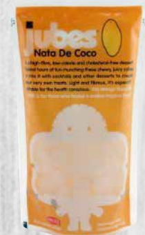
Jans Jubes Nata De Coco 12.7 oz