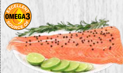
Fresh Salmon Fillet