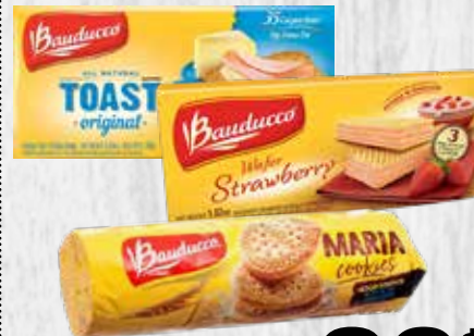
Bauducco Maria Cookies 7.06 oz, Wafers or Toast 5 oz Selected Varieties