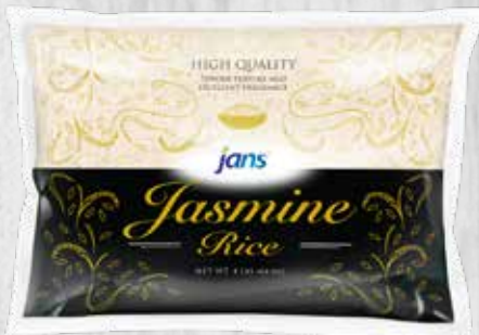
Jans Jasmine Rice 4 lb