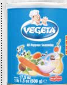
Vegeta All Purpose Seasoning 17.6 oz, Armenium Red Pepper Paste Hot or Mild 520 Grams