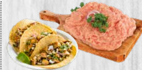
Chicken Leg Meat Ground, Diced, Al Pastor or Marinated Fajitas