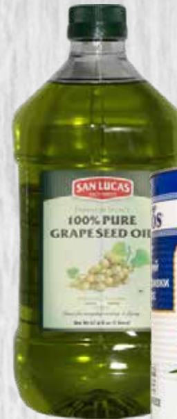
San Lucas Pure Grapeseed Oil 2 Ltr or Pindos Greek Black Olives 2.5 Kg