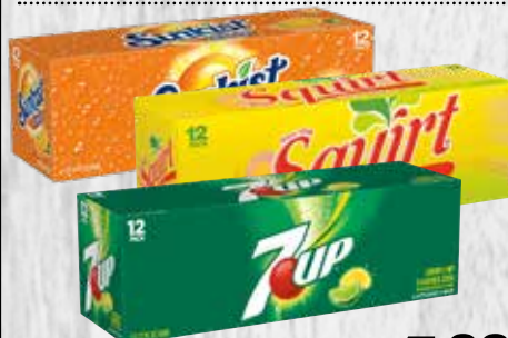
7Up Soda 12 Pk 12 oz Selected Varieties