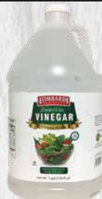
Lombardi Distilled Vinegar Gallon