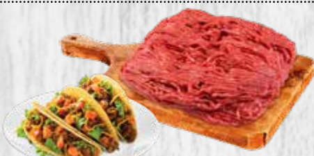
Diced Beef Steak or Ground Beef 73% Lean