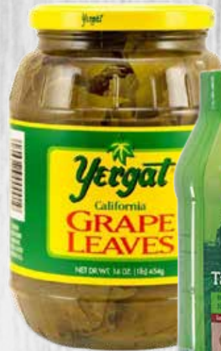
Yergat Grape Leaves 16 oz or Al Wadi Tahina 32 oz