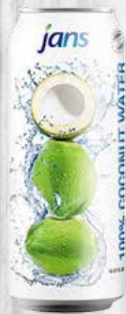
Jans Coconut Water 16.6 oz