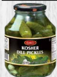
Zergüt Russian Style Pickles or Kosher Pickles 56 oz