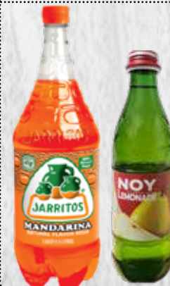
Jarritos Soda 1.5 Ltr, Noy Tarragon or Pear Lemonade 330 ml