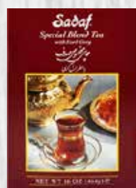
Sadaf Special Blend Earl Grey Tea or With Cardamom Tea 16 oz