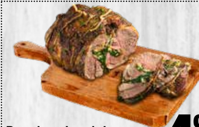
Boneless Lamb Leg Chops, Roast or Ground