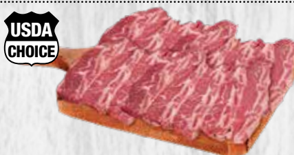
Beef Short or Flanken Ribs Regular or Marinated