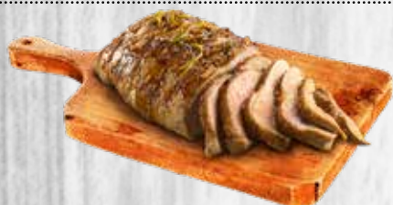
Center Cut Pork Loin Chops or Pork Al Pastor