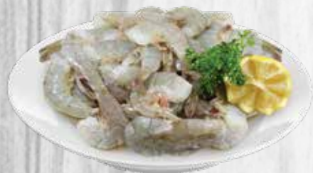
Head On Raw Shrimp 30-40 ct 4 lb Box