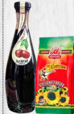
Ararat Premium Nectars 750 ml Selected Varieties, Mr. Martin Sunflower Seeds Salted or Regular 200 Grams