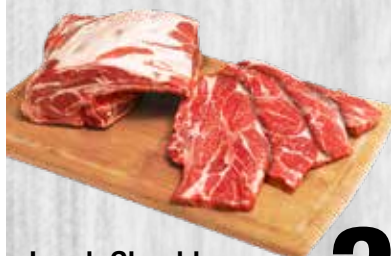
Lamb Shoulder Chops or Roast