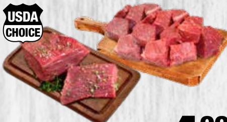
Shredding Beef or Beef Stew Meat