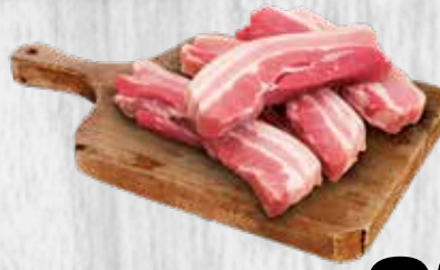
Pork Ribbed Belly or Pork Short Ribs