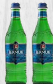
Jermuk Mineral Water 330 ml

MUST BUY 4 +CRV Single Unit $1.99 ea +tax +crv