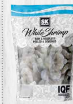
SK EZ Peel Headless Raw Shrimp 16-20 ct 2 lb Bag