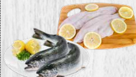
Catfish Fillet or Whole Trout