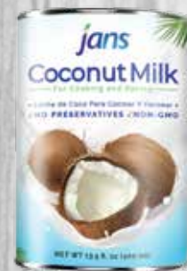
Jans Coconut Milk 13.5 oz