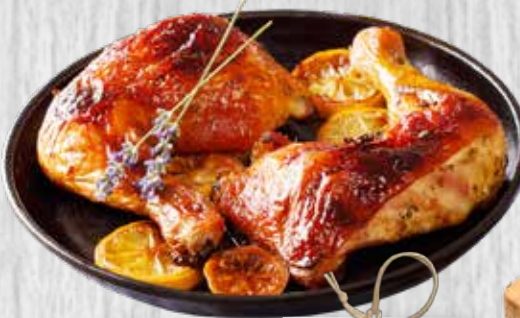
Chicken Leg Quarters 10 lb Bag