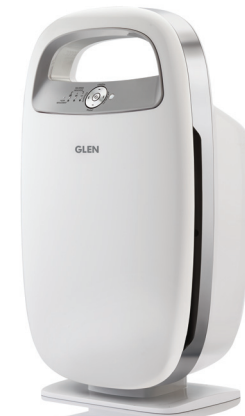
AP 6031 45 W Maximum room coverage area 310-450* Sq. Ft.