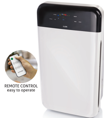
REMOTE CONTROL easy to operate