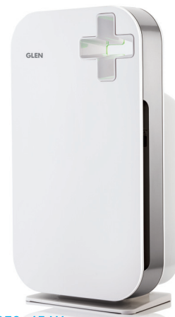
AP 6032 45 W Maximum room coverage area 590-700* Sq. Ft.

If not using the auto mode you can select from 3 speed levels. Select boost power if you need an extra strong airflow when the air in the room is very dirty.