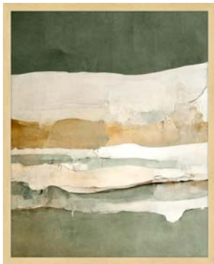
Fields 30" x 40"