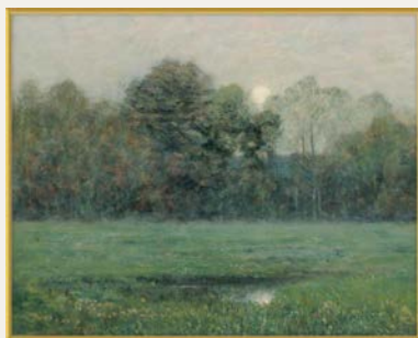
Moonrise 30" x 24"