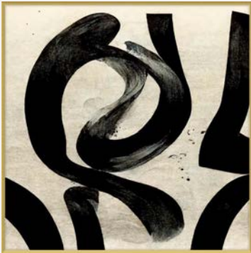
Brushstrokes I 30" x 30"