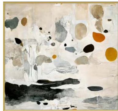
Drip 30" x 28"