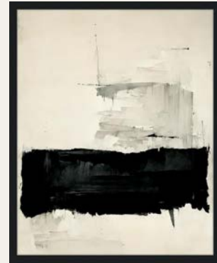
Solitude 32" x 40"