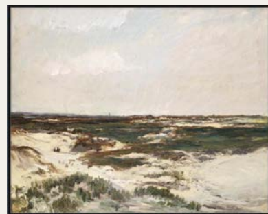
White Dunes 30" x 24"