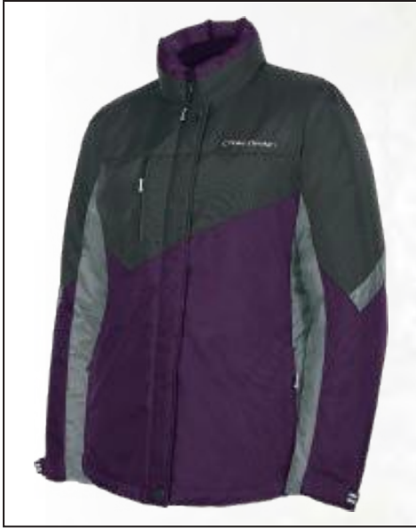
189822 3DK Plum xs to 2xl