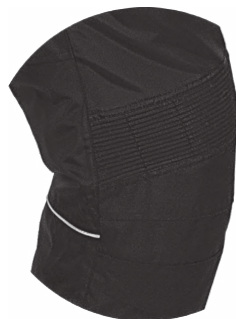
Triple padded articulated knee patches with power pleating