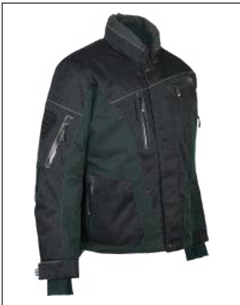
178122 HR0 Black Herringbone s to 3xl