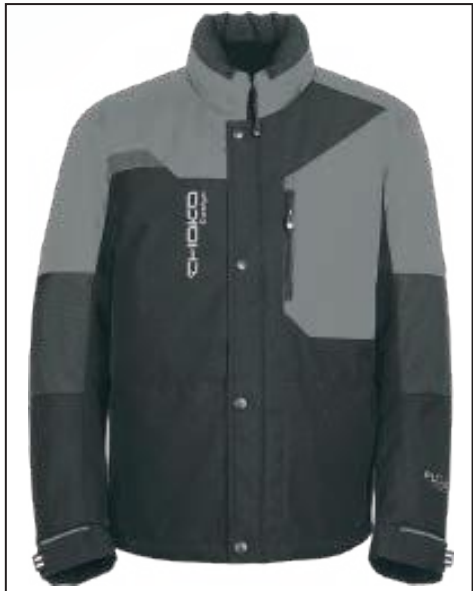
196122 900 Grey s to 5xl