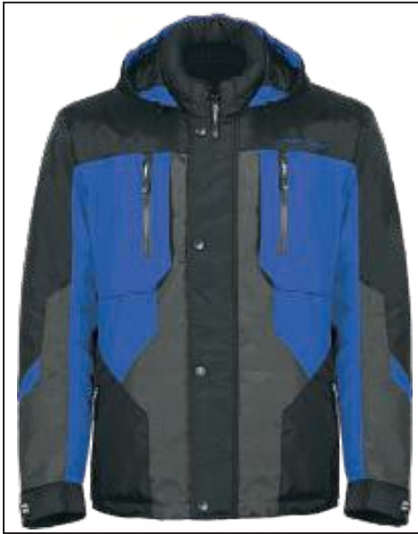
195123 200 Royal s to 2xl