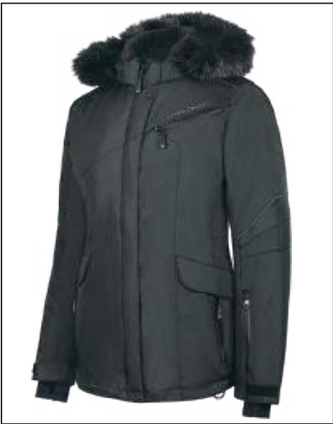
187123 000 Black xs to 4xl