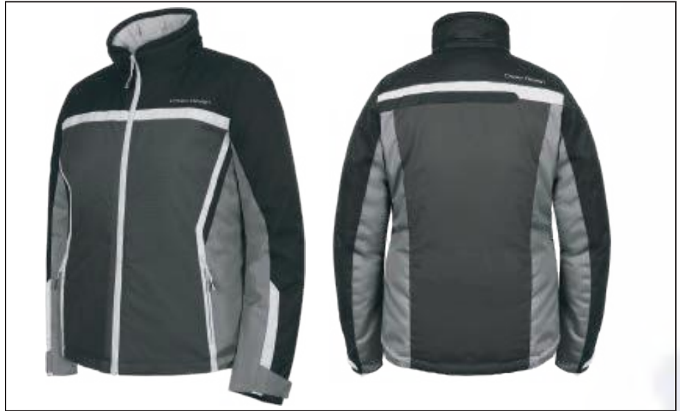
186122 900 Grey xs to 2xl