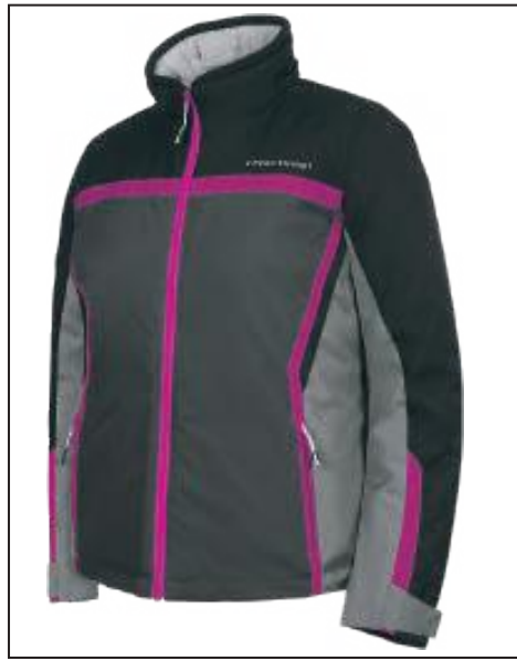
186122 BRY Berry xs to 2xl