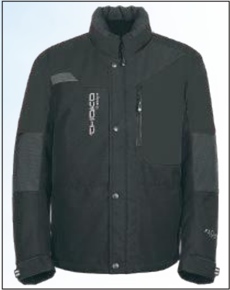
196122 000 Black s to 7xl