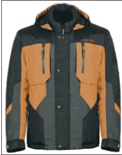
195123 BRN Bear Brown s to 2xl