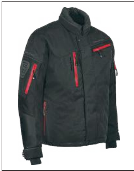
178122 001 Red s to 2xl