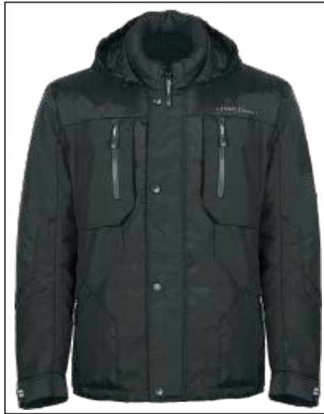
195123 000 Black s to 3xl