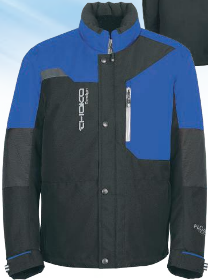
196122 200 Royal s to 2xl