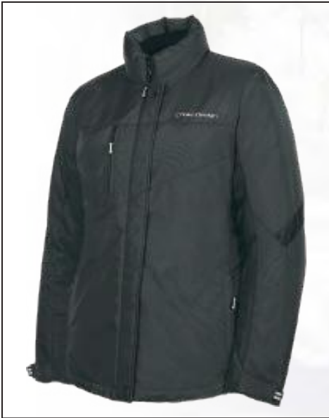
189822 000 Black xs to 3xl