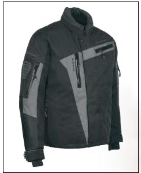
178122 900 Grey s to 2xl