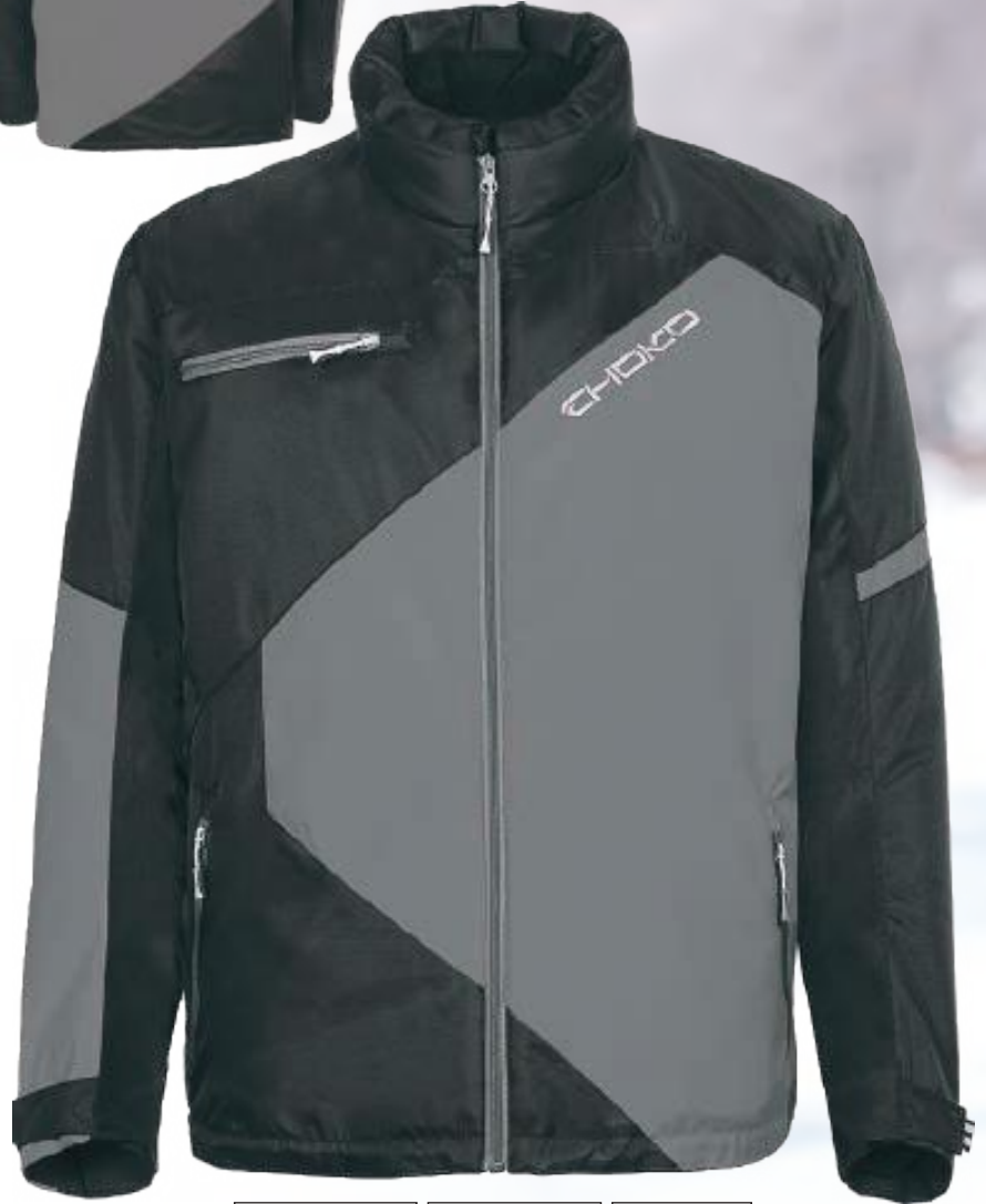
199822 900 Grey s to 5xl