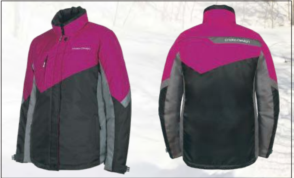
189822 BRY Berry xs to 2xl