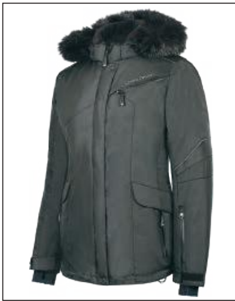
187123 900 Dark Grey Bengaline xs to 2xl