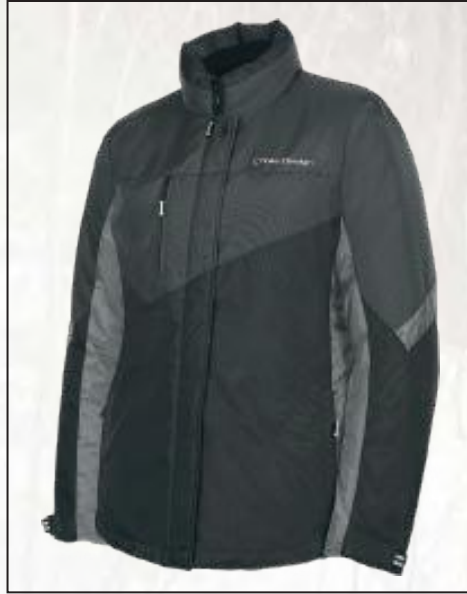
189822 900 Grey xs to 2xl