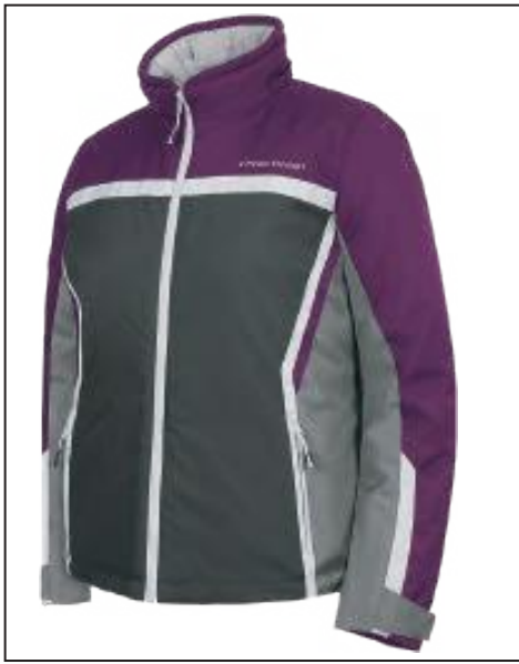
186122 3DK Plum xs to 2xl