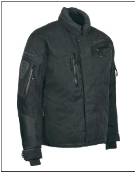
178122 000 Black s to 3xl