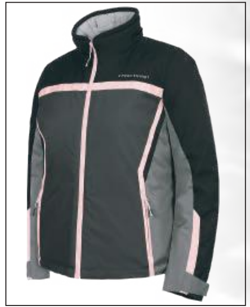
186122 800 Pink xs to 2xl