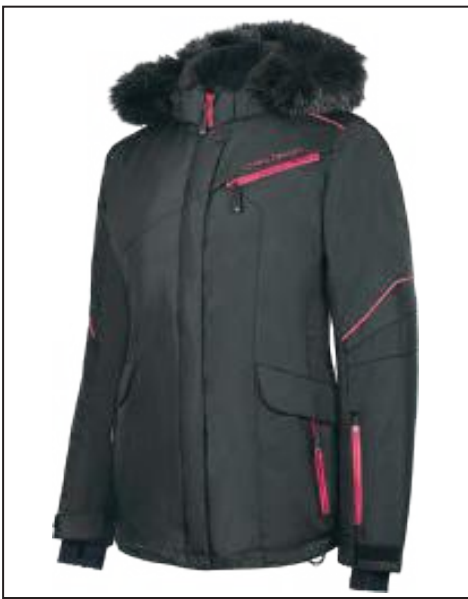
187123 8R0 Black Bengaline Rose Red xs to 2xl