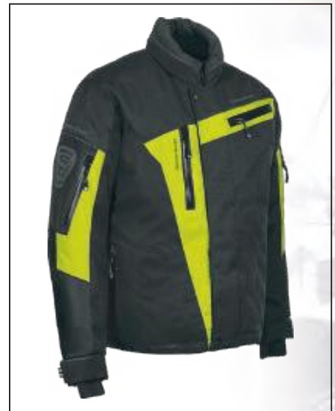
178122 SFT Safety Lime s to 2xl