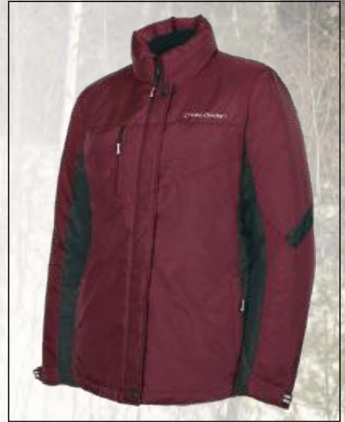
189822 BRG Burgundy xs to 2xl