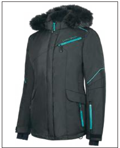
187123 500 BlackBengaline Lake Green xs to 2xl