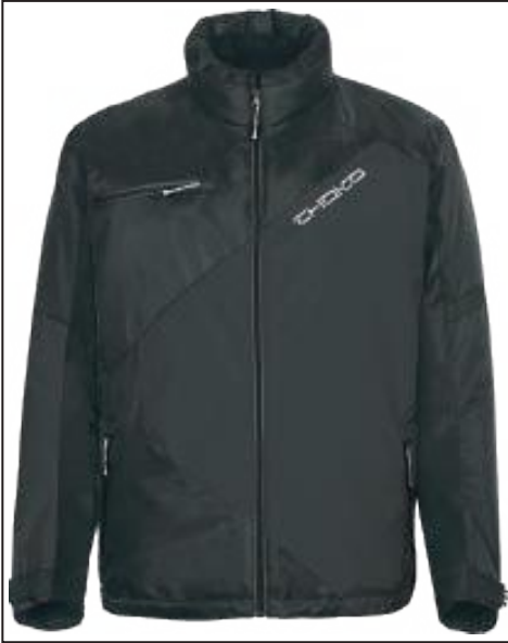
199822 000 Black s to 7xl