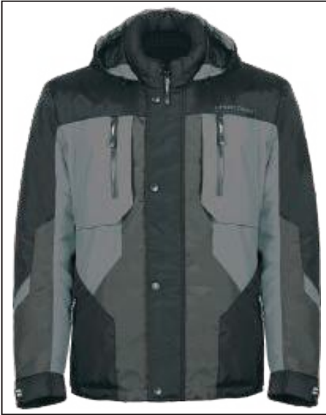
195123 900 Grey s to 2xl