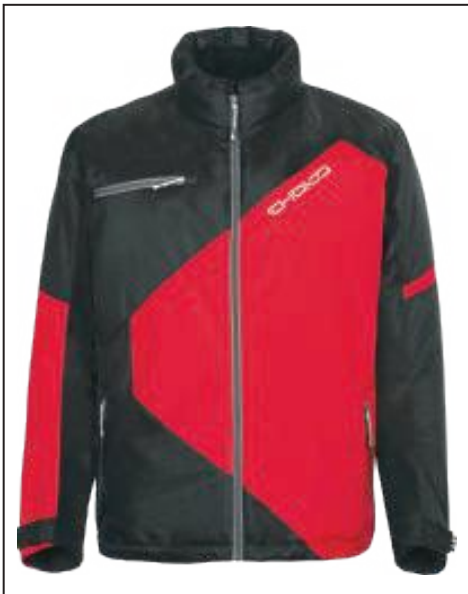
199822 100 Red s to 2xl