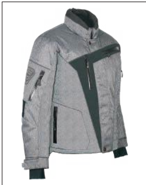
178122 HR9 Charcoal Herringbone s to 2xl