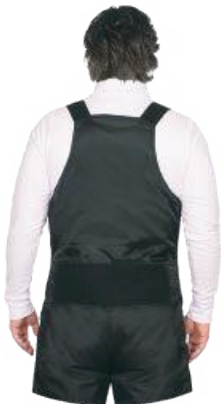
Power Pleated padded stretch back