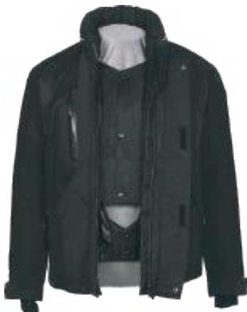
Built-In Wind Shield Vest