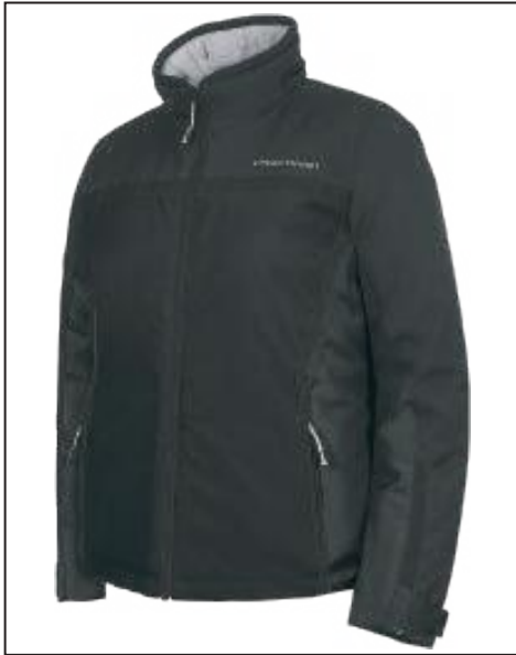
186122 000 Black xs to 3xl