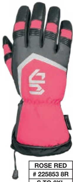
ROSE RED # 225853 8R S TO 2XL