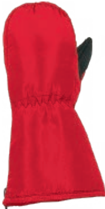
RED # 222201 10 SIZES S TO L (2 TO 6)