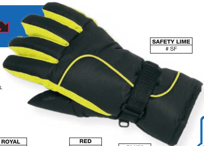
SAFETY LIME # SF

KIDDIES : # 225248 sizes s to l (2 to 6) CA$22.95