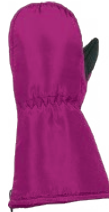
BERRY # 222201 BR SIZES S TO L (2 TO 6)