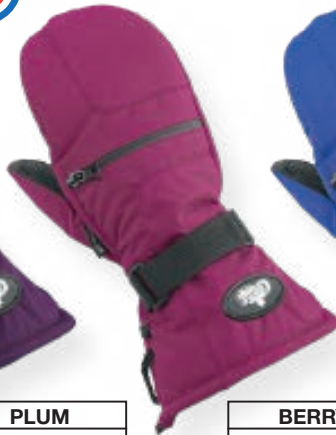
BERRY # 222108 BR XS TO XL (8 TO 16)