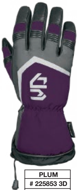
PLUM # 225853 3D S TO 2XL