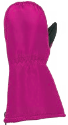
FUCHSIA # 222201 H8 SIZES S TO L (2 TO 6)