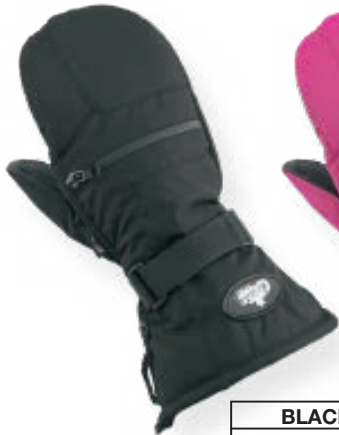
BLACK # 222108 00 XS TO XL (8 TO 16)