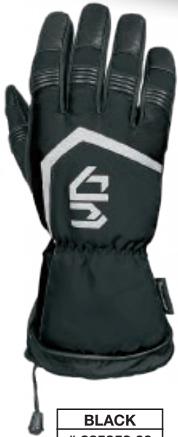
BLACK # 225853 00 XS TO 2XL