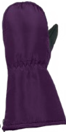
PLUM # 222201 3D SIZES S TO L (2 TO 6)