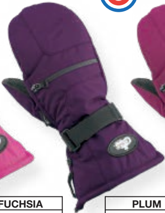
PLUM # 222108 3D XS TO XL (8 TO 16)