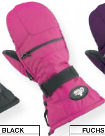
FUCHSIA # 222108 H8 XS TO XL (8 TO 16)