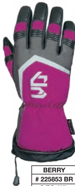
BERRY # 225853 BR S TO 2XL