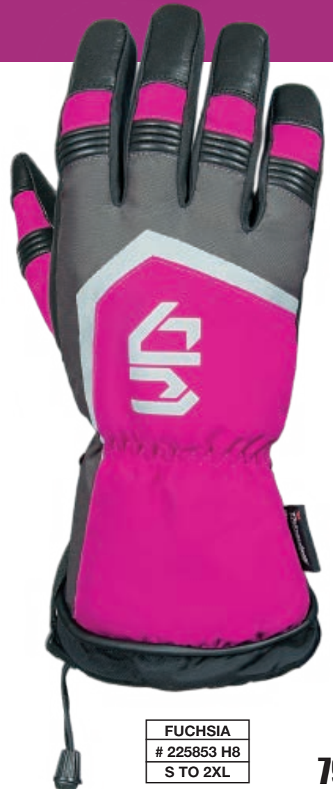
FUCHSIA # 225853 H8 S TO 2XL