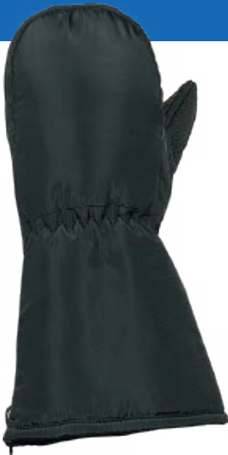
BLACK # 222201 00 SIZES S TO L (2 TO 6)