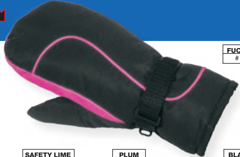
FUCHSIA # H8

YOUTH : # 222148 sizes xs to xl (8 to 16)