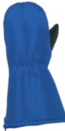
ROYAL # 222201 20 SIZES S TO L (2 TO 6)