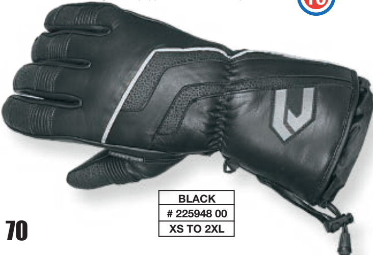
BLACK # 225948 00 XS TO 2XL