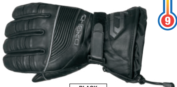
BLACK # 225201 00 XS TO 2XL