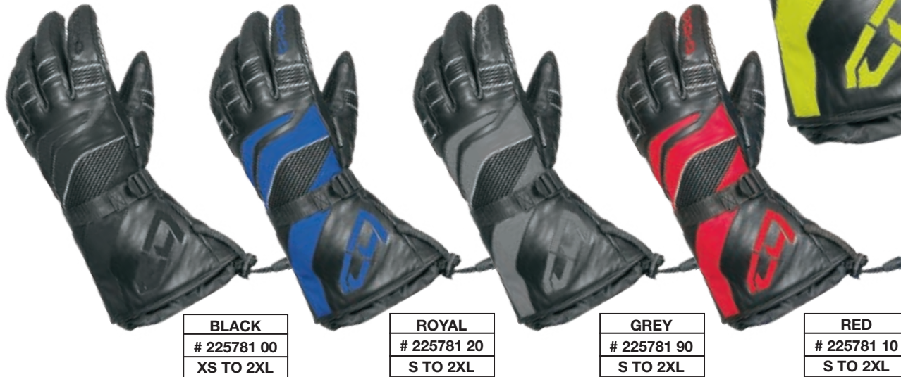
BLACK # 225781 00 XS TO 2XL