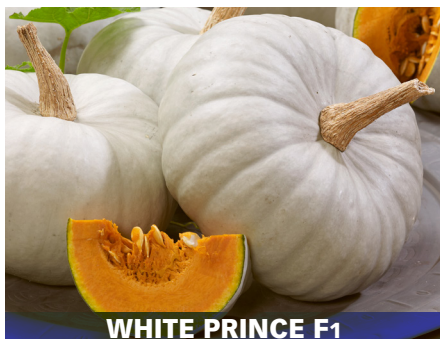
WHITE PRINCE F1

95 days to maturity. Blue Harvest F1 is a uniquely blue-skinned pumpkin, and the fruit weighs 7 to 8 pounds and measures 9 inches by 10 inches. This pumpkin has excellent flesh quality and is a must grow for anyone wanting to add color into their pumpkin lineup.