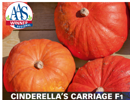
CINDERELLA'S CARRIAGE F1

90 days to maturity from seed. Pepitas F1 is a 2016 AAS National Winner. This winner is nutritious and delicious, and it is excellent eaten fresh as well as roasted. Each plant produces a high yield of medium-sized orange fruits with decorative green stripes. Not only is Pumpkin Pepitas F1 a delicious treat, but you can also decorate with them during the fall season for an exciting and unique look for your arrangements.