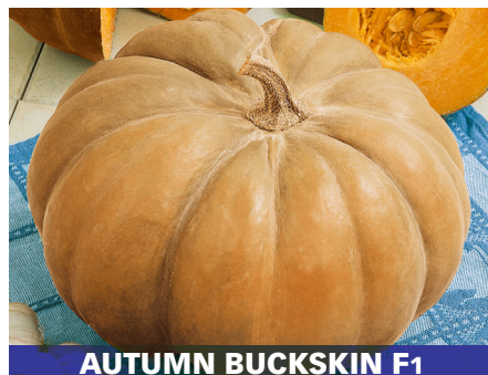
AUTUMN BUCKSKIN F1

A smaller version of White Harvest, Pumpkin White Prince F1 is a true white pumpkin. The fruits measure 7- to 8-inches tall, with a circumference of 14- to 15-inches wide. Pumpkin White Prince F1 produces lovely pumpkins that will look gorgeous in your home or anywhere you place them.