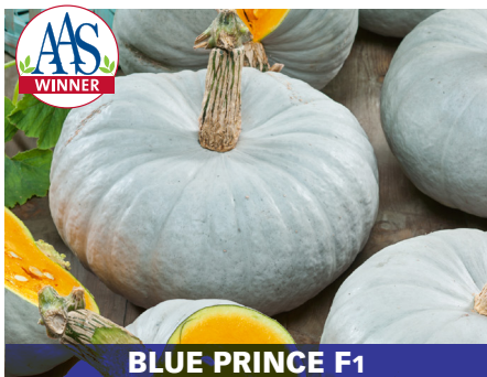
BLUE PRINCE F1

110 days to maturity. This 2020 AAS National Winner is gorgeous and delicious! The plant has vigorous trailing vines that produce seven to nine beautiful, flattened, blue pumpkins, and its flesh is orange, non-stringy, and sweet. Grow Blue Prince F1 for beautiful fall decor and bake its flesh for a sweet and creamy treat.