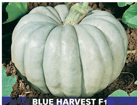
BLUE HARVEST F1

100 days to maturity. Cinderella's Carriage F1 is a 2014 AAS Regional Winner. This variety is a dream come true for any princess-loving child who wants to grow their very own fairytale pumpkin. Its skin is bright red-orange, and the fruits are enormous, ranging from 23 to 35 pounds. Cinderella's Carriage F1 is the first hybrid Cinderella-type pumpkin on the market. You do not want to miss out on this epic fairytale!