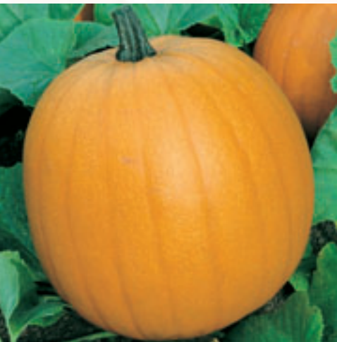
Harvest Gold F1

85 days to maturity. This little darling weighs about 1.5 pounds and has a tremendous yield of perfect deep orange slightly ribbed miniature pumpkin. Harvest Princess F1 is semi vining and sets numerous fruit per plant, which makes it a must variety for any home garden or commercial pumpkin grower.