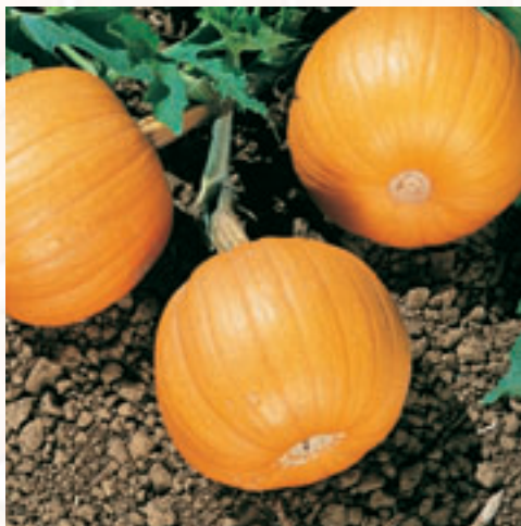
Harvest Queen F1

Harvest Gold is popular with both home gardeners and commercial growers. This hybrid has a precocious gene that causes the pumpkin to begin with a yellow color and turn golden orange at maturity. This unique gene along with Harvest Gold F1's early maturity can allow growers to catch up after adverse planting conditions.