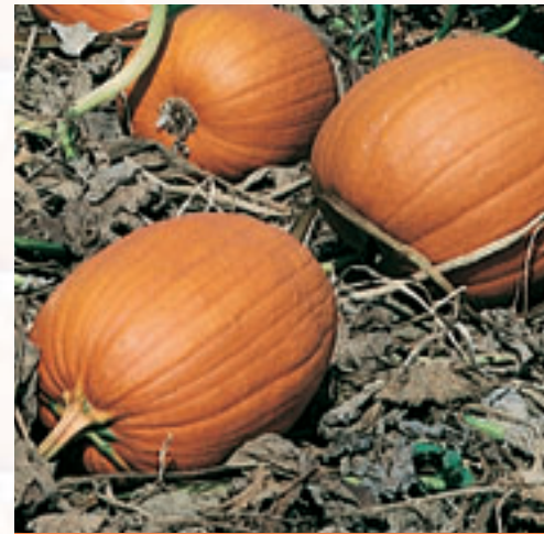
Harvest Jack F1

Similar to Touch of Autumn F1, but with powdery mildew tolerance. Long handles with good attachments and skin of deep orange color make this semi-bush pumpkin a big yielder and matures in 85 days under most conditions. Fruit size is in the 1 lb. pie market, and is recommended for cooking, painting and carving.