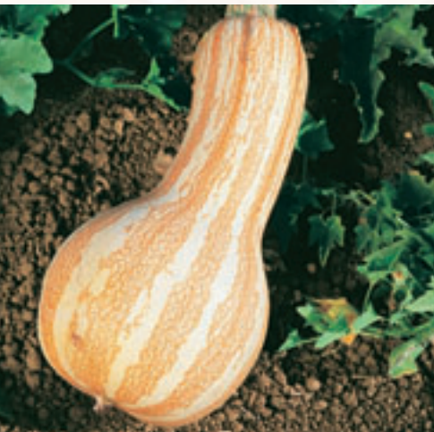
Autumn Colors F1

Ninety days to maturity. A white skinned ornamental pumpkin with thick orange flesh of excellent eating quality, eight to twelve inch diameter, fruit weighs ten to sixteen pounds. Casper's skin has less bluing than many other white varieties. The handle is tan colored with a corky texture.