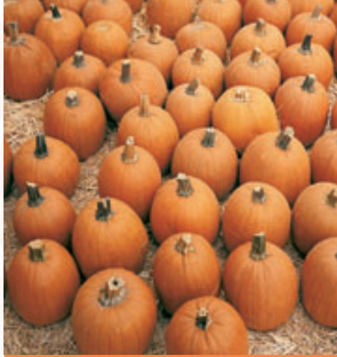
Harvest Ace F1

White jack be little hybrid with deep ribbed fruit. Vines are vigorous with excellent cover, plants set high numbers of unique fruit. Excellent eating quality and flavor.