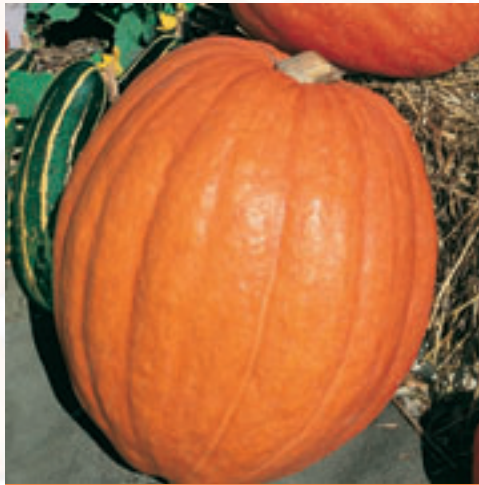
First Prize F1

A cutie hybrid is for the small ornamental market, but also has excellent edible qualities. Bumpkin F1 has a semi bush plant habit with excellent yield potential. Fruit are larger Jack be little type with dark orange color and strong dark green handles. A big hit for the novelty markets.