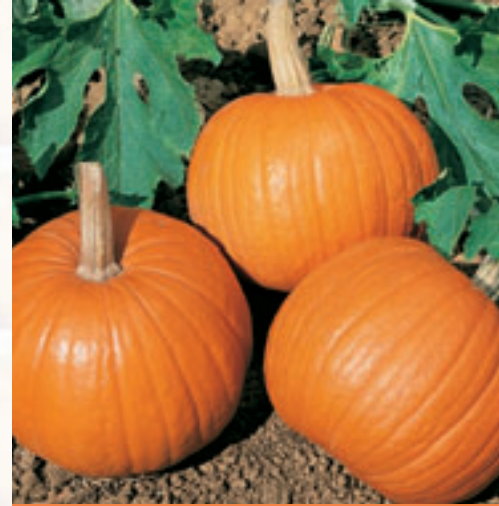
Wee Be Little

Ninety five days to maturity. Uniquely blue skinned pumpkin, from Australia, usually weighs seven to eight pounds with a ten inch diameter. Jarradale has excellent flesh quality a must for any market grower or gardener who wanting to add color to displays and packs.