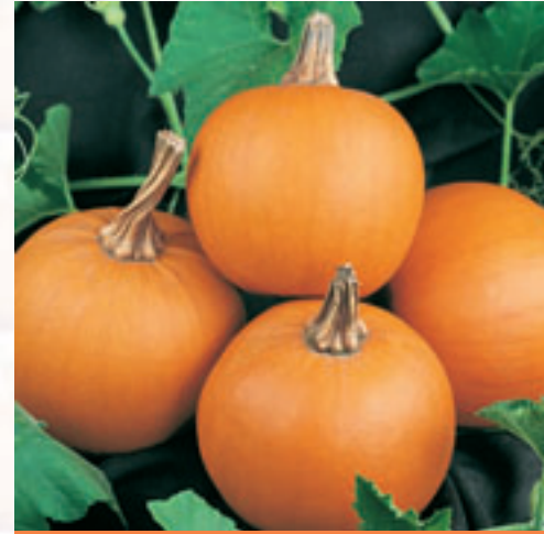
Harvest Prince F1

We have had quite a few requests for a 10-12 lb. pumpkin with powdery mildew tolerance. Hobbit F1 PMR will work perfectly for growers to fill out their smaller pumpkin needs. This variety sets much earlier than most PMR hybrids.