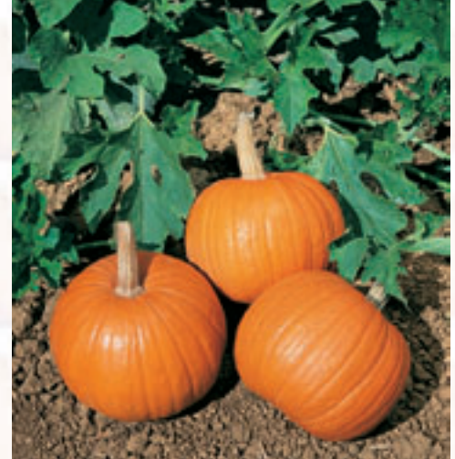
Harvest Princess F1

The size of this pumpkin will range from 80 lb. to a whopping 300 lb. with color superior to the Atlantic types, this will be a great addition for those who want the biggest and best. The fruit matures in 120 days from planting on vigorous vines. Compare to Prizewinner F1.