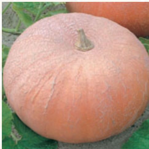
Yellow of Paris

Huge upright pale orange colored pumpkins which weigh up to eight hundred pounds. Vines are very vigorous and must have large spacing and planting area. PVP variety from Howard Dill in Nova Scotia. Very long season matures in one hundred and twenty days.