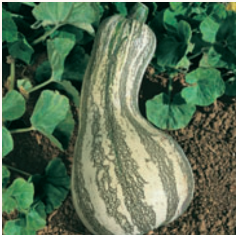
Green Striped Cushaw

Traditional variety from the south of France. Gorgeous, big flat fruits are heavily ribbed and look similar to large wheels of cheese. Fairytale fruit average twenty pounds and ripen to a rich brown when fully ripe. The deep orange flesh is very fine grained, one of the best for baking. Long season, matures in one hundred and ten days.