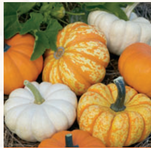
Mini Harvest Blend

This 1999 All American Selection winner, matures in about ninety-five days. Fruit are small almost round, three inch by three inch, weighing one pound. Wee Be Little is well suited for baby carving pumpkins or painting. Also has very tasty flesh when cooked.