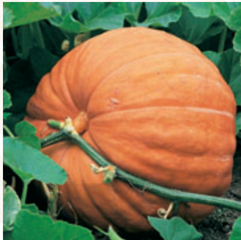
Dill's Atlantic Giant

Ninety days to maturity. This pear shaped pumpkin has a crookneck, and weighs up to twenty five plus pounds. Fruits have a hard thin smooth rind of creamy white with green and orange stripes, the fine grained sweet golden flesh is excellent for baking and cooking, excellent keeper. The unique shape and color combination add spice to any fall display or garden.