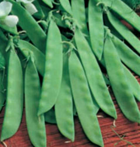
Oregon Sugar Pod