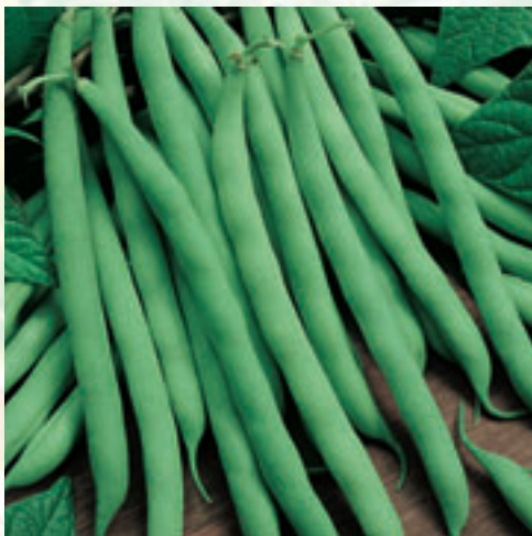
Bush Blue Lake 274

Sixty days to maturity. Plant early in spring or fall, harvest before hot weather, no central head but many strap-leaves and side shoots, looks like mustard with many dime-sized green buds, early European branching variety for tops and tender flower shoots, will not over winter in cold climates.