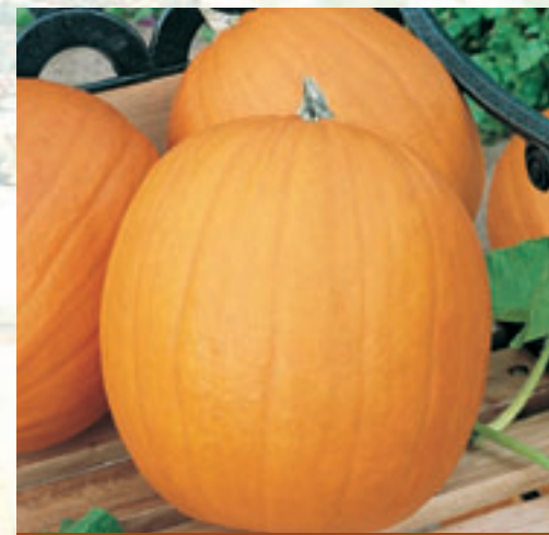
Jack O Lantern

Fifty days to maturity. Nearly round globe shaped, blood-red three inch solid roots. Main season crop used canning and cooking for home gardens, all purpose, prolific, the standard for beets.