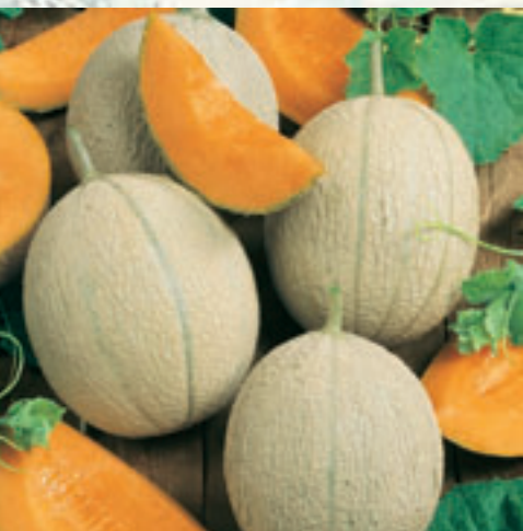
Hearts of Gold

80 days to maturity. Compact stocky 20 inch plants, dark blue-green solid medium green heads, few side shoots, For production all year round as the name states. All Seasons was selected for heat and cold tolerance. This variety may work when many others will not.