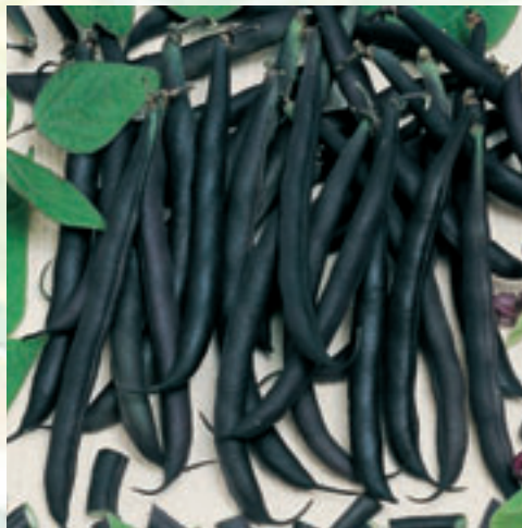
Royalty Purple Pod

66 days to maturity. 28-30 inch vines produce 4-5 inch stringless, smooth edible pods. Heavy yields for both fresh market and freezer use. PM, Fusarium Wilt, PEMV resistant.