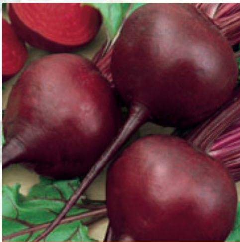
Detroit Dark Red

Eighty to one hundred days maturity depending on the variety. These tasty old time tomatoes are all over the place, from grocery chains to farmers markets. The US consumer just can't seem to get enough. Many Seeds by Design distributors offers a full line of Heirloom tomatoes: Brandywine types such as black, pink, red and yellow, add to that some Cherokee Purple, Green Zebra, White Wonder and a beautiful orange like Nebraska Wedding, you have an heirloom pack that can not be beat.