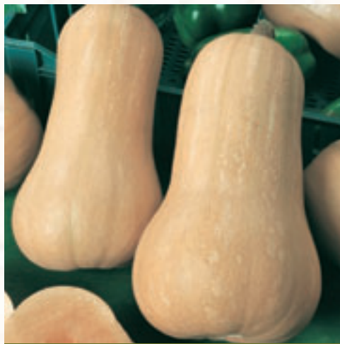
Indian Brave F1

This will be a great addition to your Oriental vegetable line. The chestnut flavor and bright orange rind of this buttercup will be an outstanding product for both commercial and home garden markets. Orange Dawn matures in 90 days and produces an abundance of tasty fruit on a semi bush plant. The fruit have great holding ability and are packed with vitamin C, a great addition anywhere. Compare with Amber Cup squash.