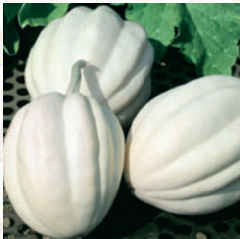
White Ace F1

Mini Magic is a component blend of three miniature Hubbard squash. All varieties have three to five pound fruit and are semi bush habits. You can purchase this variety mixed or separately. Ask for Blue Magic, Orange Magic or Green Magic if you wish to plant separately. Hubbard squash are prized for their fine grained flesh and nutty flavor.