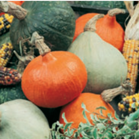
Mini Magic F1

One hundred days to maturity. This colorful mixture of many small type Pepo gourds including Egg, Spoon, Warty Dumpling. This heterozygous mixture has been selected for its bright colors, warts and semi wings. A must for everyone fall displays and gardens.