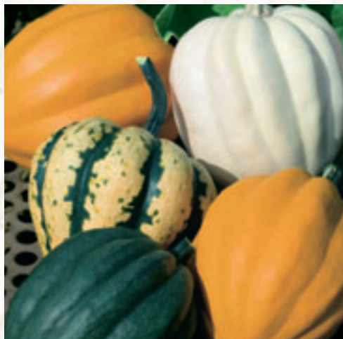
Autumn Acorn Blend

Very productive compact dark green bush plants, excellent fruit set, fifty days for light yellow nutty tasting three inch fruits, eighty days for five inch golden yellow winter Acorn fruits. Grown with other colored Acorns Table Gold makes a very attractive bin mixture.