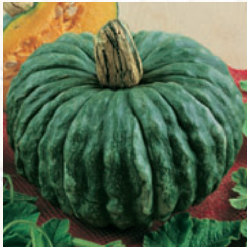
Marina de Chioggia