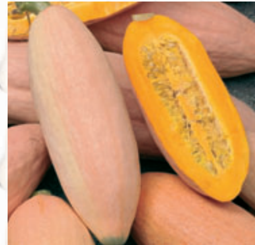
Pink Banana Jumbo

Seventy days to maturity. White Ace is a true white Acorn. The fruit weigh about two pounds and have perfect shape and uniformity. Flesh is sweet and full flavored, excellent baked. Plant White Ace with gold, green, multi colored Acorns for a striking variation in the produce bin.