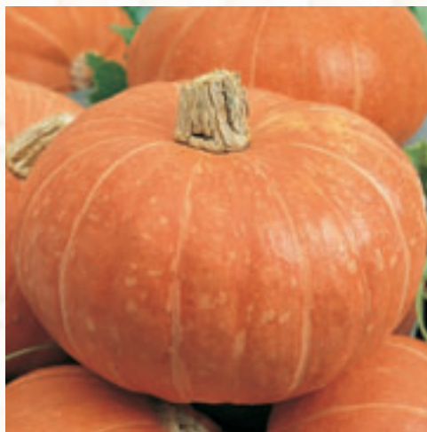
Orange Dawn F1

A miniature (4-6 lb.) Hybrid Blue Hubbard with the normal shape, color, and flesh qualities of the Hubbard family. Has the fine-grained, tasty flesh that you are used to, but a size that is friendlier to the smaller families of today.