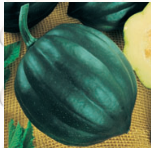
Table Princess F1

Another unique heirloom from Australia has an incredible shelf life. Trimable has a shelf life up to 2 years. This three chambered blue winter squash. Has wonderful flavor and flesh quality. The vigorous vines protect these beauties well. A great display or eating squash.