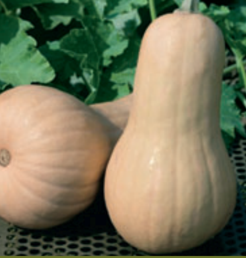
Big Chief F1