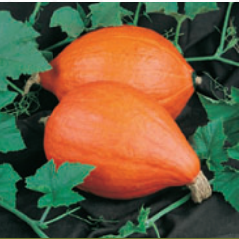
Golden Health F1

Ninety days to maturity. Flattened, ribbed, buff colored fruits, with deep orange, sweet flesh, excellent in pies, average weight is eight pounds. Tan fruits store well, and are named for its resemblance to a wheel of cheese.