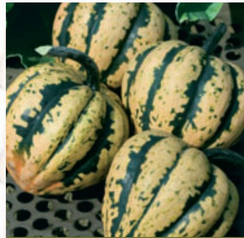
Mardi Gras F1

With gardens and farm land shrinking it makes sense to grow all your favorite winter squash in one place. Or buy it in one value priced packet. Winter Harvest Blend can be a mixture of any squash or pumpkins. Contact us to create your own personal mixture.