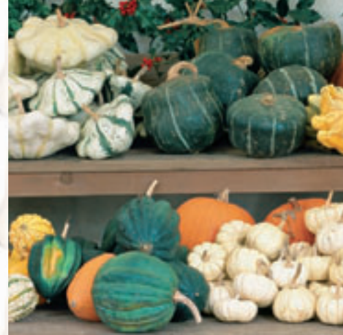
Winter Harvest Blend

This is a component blend of Table Princess, Table Gold, White Ace and Mardi Gras. With planting these four varieties together you get the best of all worlds. The picture says it all. You can order these pre mixed or have the varieties shipped separately.