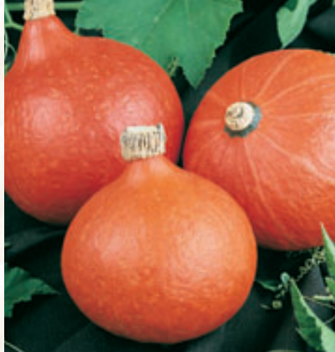
Orange Magic F1

85 days to maturity. A now standard winter squash, ivory cream skin with dark green stripes, 7-9 x 3 in. diameter, rich sweet potato like flavor, short prolific vines, PMT and a good keeper. Piñata has won many taste tests with its nutty flavor.