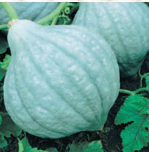
Blue Magic F1

Our hybrid winter squash Festival is in the 2 pound size, superior flesh quality with dramatic flavor improvement when compared to acorns, plus has ornamental qualities as well. Vine is semi bush, yielding an abundance of delightful tri colored fruit for fall use or short-term storage.