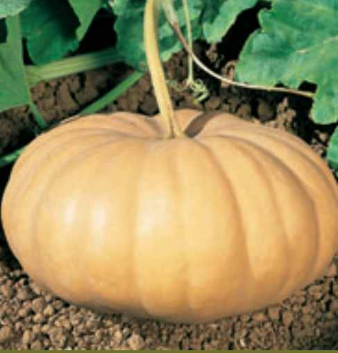
Long Island Cheese