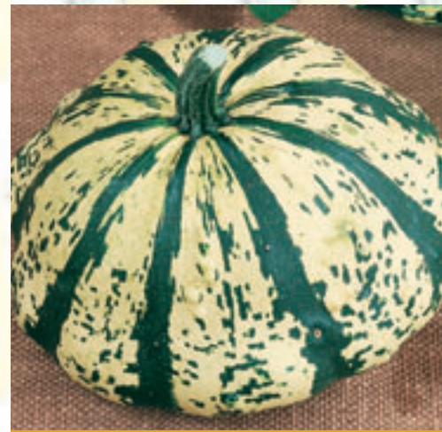
Partial Eclipse F1

A colorful blend of Total Eclipse, Sunbeam, Lunar Eclipse, Partial Eclipse and Moonbeam. These five hybrid scallops make a perfect picture having all colors represented. Every gardener will love to grow this collection of tasty and beautiful summer squash.