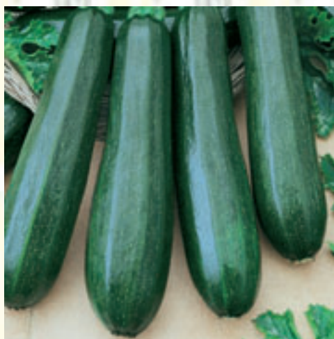
Garden Spineless F1

What would a crookneck be without its straightneck partner. Amberpic is our new straightneck hybrid. The fruit are smooth with a glossy yellow color. Very early maturing with a long fruiting period. Fruit store and package well.