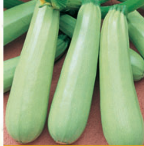
Super Clarinette F1

Forty days to maturity. Pale green pie shaped fruits with scalloped edges. The light green, fine textured flesh is two inches deep and four inches wide, with small blossom scar. Plants are semi open bush, heavy yielding, an improved Patty Pan type, excellent quality yields than other bush scallops.