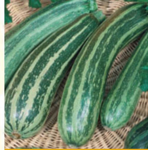
Straito D' Italia

Forty five days to maturity. Open bush plant habit with mottled green deeply cut leaves. Fruit are two inches in diameter, greenish grey globes, small blossom scar, creamy yellow solid flesh, productive, for home gardens. Exceptional flavored French variety, delicate skin bruises easily, can be picked at one inch or stuffed at four inches.