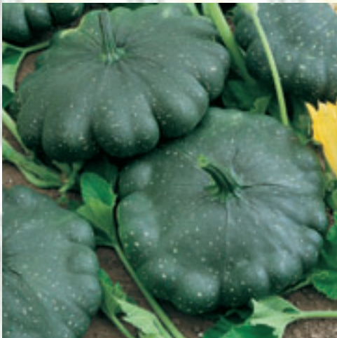
Total Eclipse F1

Early maturing at 45 days. Clarinette is a high yielding pale green to white bulbous squash for the international and ethnic markets. Plants have an open bush habit. Excellent mild flavorful summer squash.