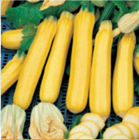
Golden Zebra F1