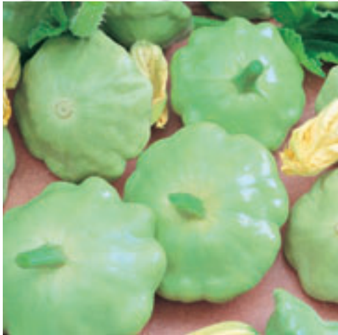
Lunar Eclipse F1

Fifty days to maturity. Bush plant produces seven to eight inch long white fruits with sweet flavor. Skin is very tender and scars easily. An Egyptian specialty, and an excellent culinary choice for home gardeners and specialty markets.