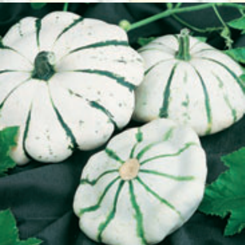
Juane et Vert

Summer Squash variety which is very popular in the Middle East, sweet fruits with excellent flavor. Fruits are pale green to white and should be picked early from seven to eight inches or less. Plants are capable of with standing harsh climatic conditions. Matures in forty days.