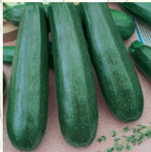
Emperors Jade F1

Early maturing in 45 days. Vigorous bush plants, straight smooth dark-green mottled fruits, best at 6-8 inches, pale greenish-white firm flesh, prolific, heavy yields.