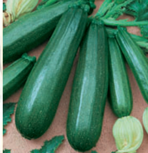
Dark Jasper F1

Garden Spineless is an excellent home garden zucchini. It produces long cylindrical fruit on a scratchless open plant for easy pickings. The dark green flecked fruit show up well on the open plant in 53 days.