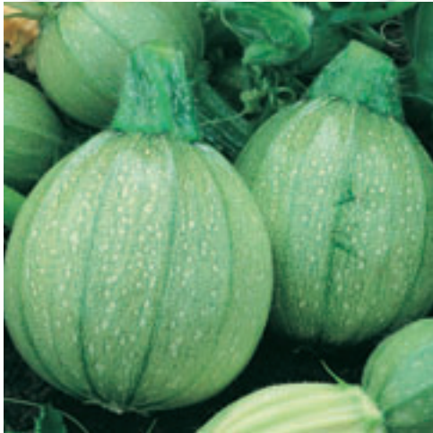
Ronde de Nice

Forty days to maturity. Oblong fruits, pale-green to cream-white, with faint green stripes, smaller at blossom end. Creamy white firm fleshed fruit are best when picked at four to six inches long, good for fresh market.