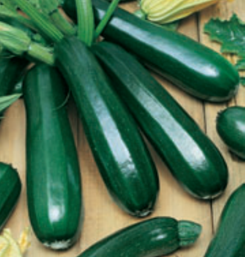
Black Coral F1