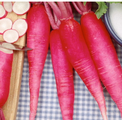
China Rose Winter

25 days to maturity. French heirloom, Fench Breakfast is a small slender taproot with a mild, spicy flavor. These oblong and blunt radish are rose scarlet with a white tip. Its flesh are crisp white.