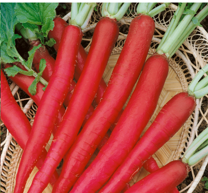
Long Scarlet Cincinnati

24 days to maturity. Rudolph grows to be 1 1/2 inch round. These cute small radishes are a deep red color and have a nice uniform shape and color. Rudolph is also packed with flavor. They are crisp, sweet and mild. Add them to your dish for an extra kick of flavor!