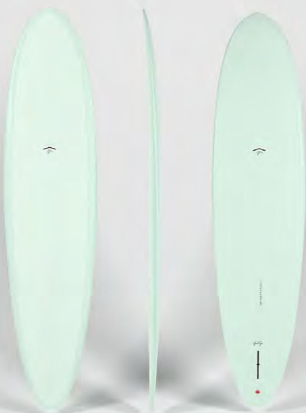
COLOR | SAG