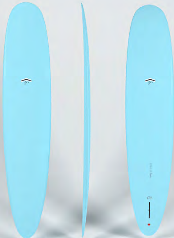
COLOR | SKY SPECIAL ORDER