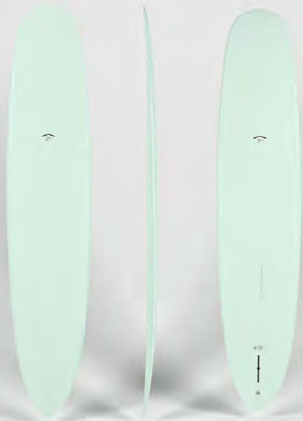
COLOR | SAG