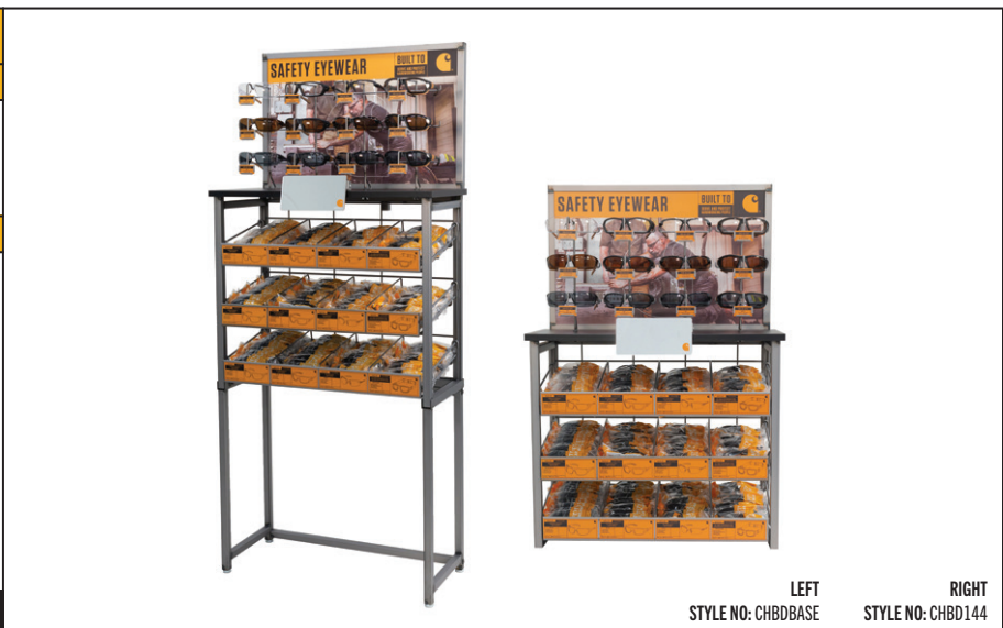
LEFT STYLE NO: CHBDBASE