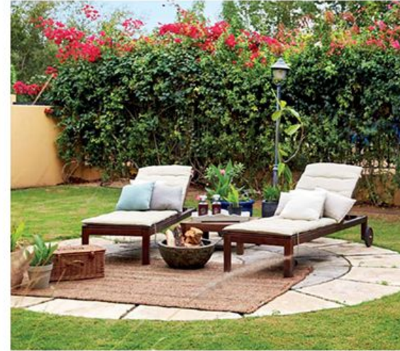
Above Previously terraced, the couple grass seeded the garden and added pampas grass borders for a greener outlook. Opposite The veranda off the living room is a peaceful spot for morning coffee, with a Byron Bay daybed and tribal cushions; Valentina updated the white plant pots with painted details.

adapt them and change them. Then the lifespan of the furniture you commission can be really long compared to anything store bought.