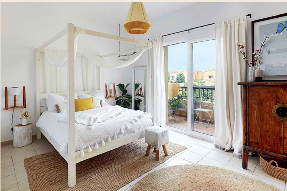
Clockwise from above The guest bedroom has a romantic holiday vibe, thanks to the custom four poster from London, sisal rugs from Pottery Barn and IKEA and wood side tables from White Moss; the cabinet is from Kenya. The home office features a bespoke desk inspired by an airplane wing, while the easel is from Valentina's childhood. She made these shelves from leather and wood, and the light shade using yarn. Bamboo hangers are an unusual accent, adding to the tactility of the room.