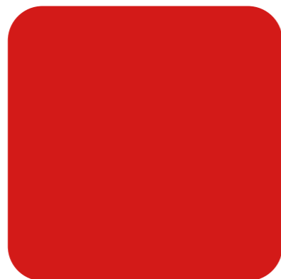
Pillarbox Red Naturale