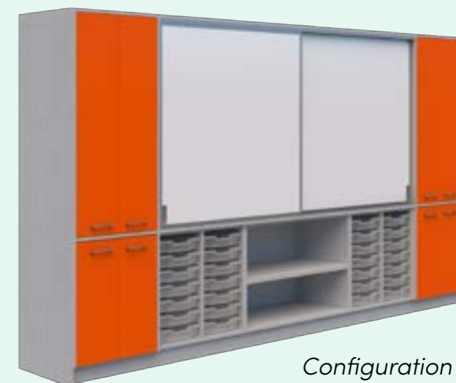
Configuration 2: 2000H x 3600W x 500D Whiteboard 2400L 28 F1 Gratnells Trays