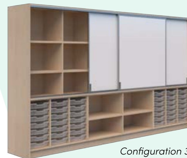
Configuration 3: 2000H x 3600W x 500D Whiteboard 3600L 42 F1 Gratnells Trays