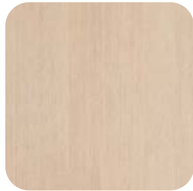
Refined Oak Naturale