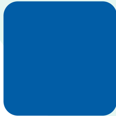
Memphis Blue Naturale