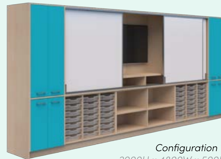
Configuration 1: 2000H x 4800W x 500D Whiteboard 2400L 42 F1 Gratnells Trays