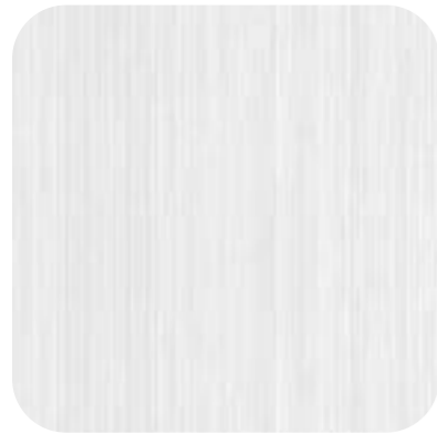
Silver Strata Naturale