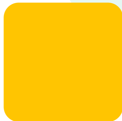
Olympus Yellow Naturale