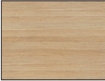
Classic Oak Naturale