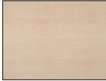
Refined Oak Naturale