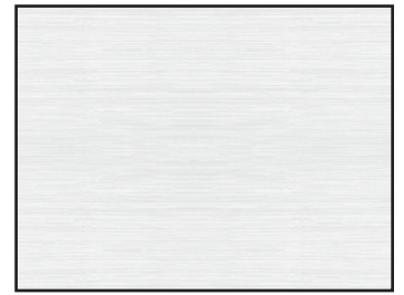
Silver Strata Naturale