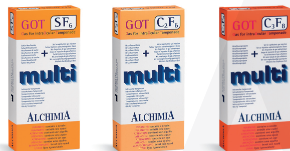
GOT 007 GOT 008 GOT 009

Each pack contains 1 gas cylinder + 1 gas injection set + 1 needle and 1 patient's wristband