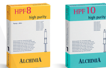
HPF 019 HPF 021