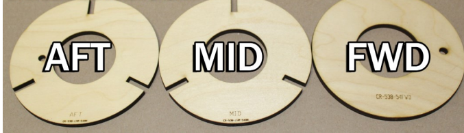
3 FIN CONFIGURATION SHOWN

This kit may be constructed one of two ways. Inserting the built motor assembly, then epoxying the fins in the slots. OR building the fin can outside the airframe, cutting the airframe fin slots to the aft and sliding the fin can up into the airframe. Please decide which flavor you prefer before proceeding with construction.