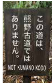
Not trail markers