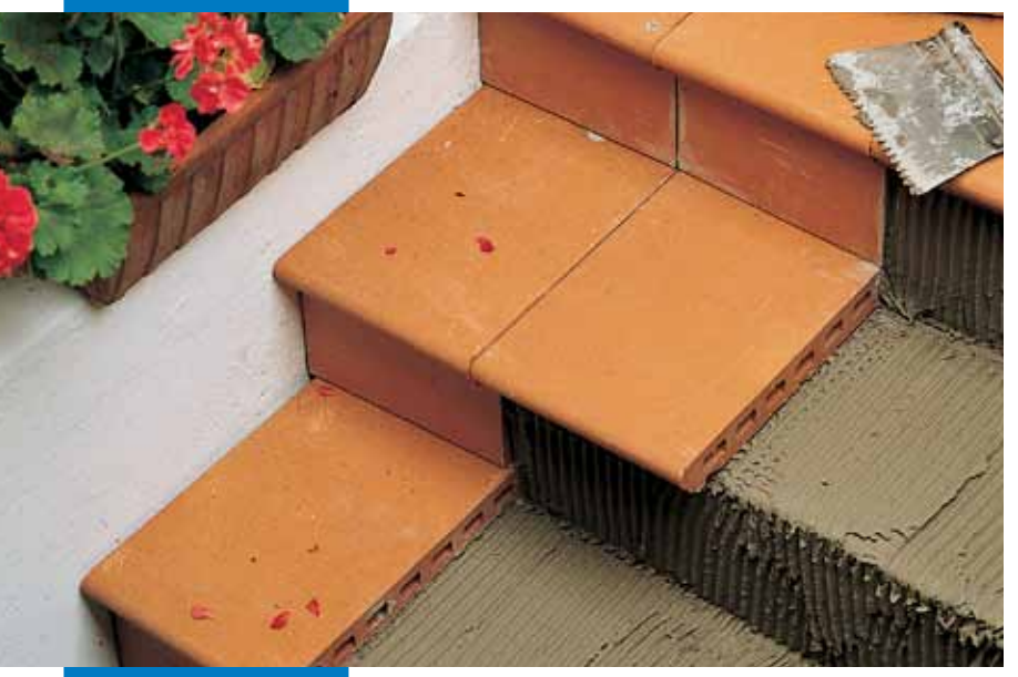
Rapid overlaying of steps

All relevant references for the product are available upon request and from www.mapei.com