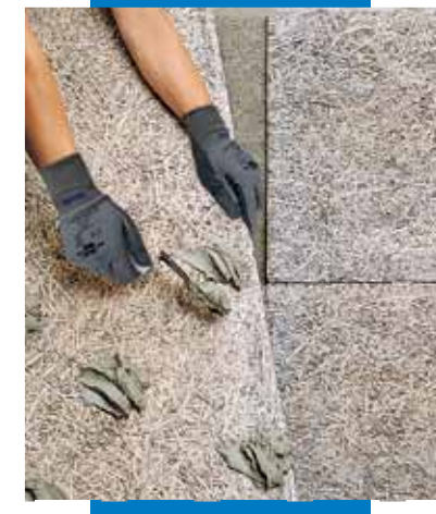
Laying heavy insulation panels