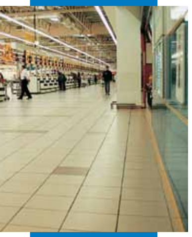
An example of an installation with Keraquick in an Auchan supermarket -Sosnowiec (Poland)