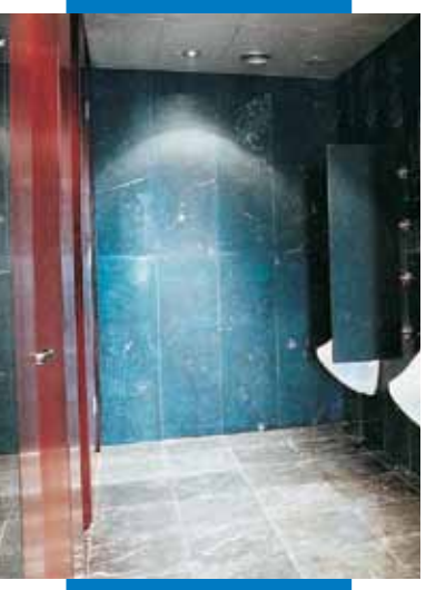
An example of an installation of marble walls with Keraquick - Feuchtwangen casinò bathroom (Germany)