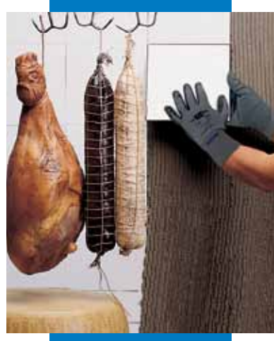
Repair work in a refrigerator unit