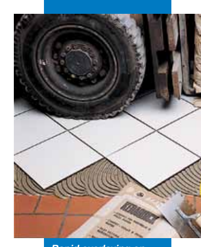
Rapid overlaying on asphalt industrial floor