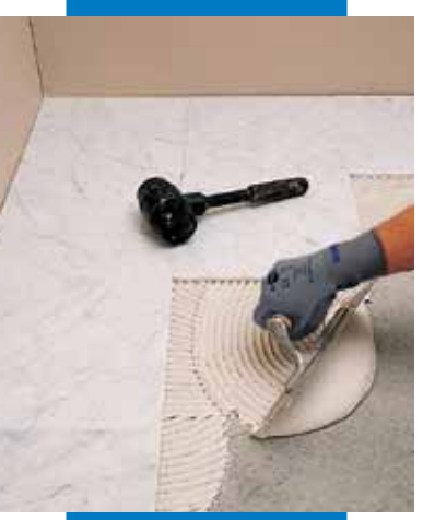
Setting white Carrara with Keraquick white