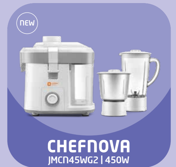
CHEFNOVA JMCN45WG2 | 450W

Chutney Jar (0.4L), Dry/Wet Jar (1L), Liquidising Jar (1.5L)