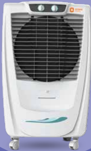
SNOWBREEZE SUPER 50 CD5002B