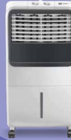
CHILLMASTER 36 & 22 CP3601H, CP2202H