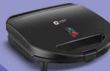
CHEFSPECIAL GRILL SANDWICH MAKER SGCS75B2 | 750W