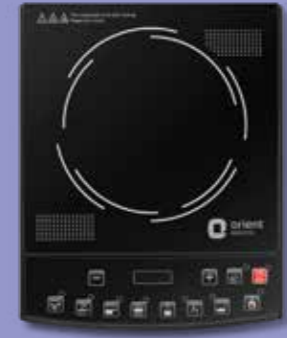
CHEFSPECIAL ICTCS16BGM | 1600W