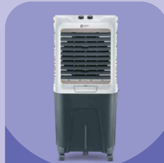
TORNADO 88, 65 & 52 CD8802HR, CD8801H, CD6504H, CD5202HR, CD5201H