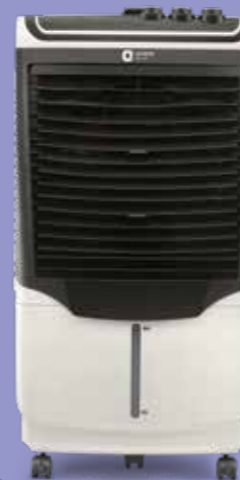
AVANTE 90 & 105 CD1051H, CD9001H