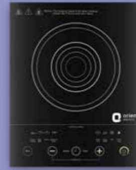
CHEFSPECIAL ICTCS21BGD | 2100W