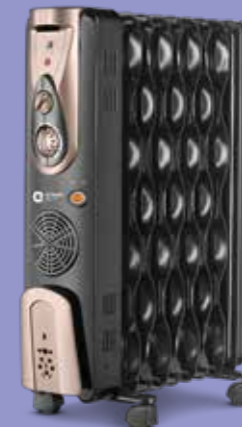
Oil Filled Radiator