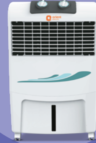
SMARTCOOL DX 35, 20 & 15 CP3502H, CP2002H, CP2003H, CP1601H