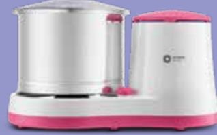
GRIND SUPER WGGS152P | 150W