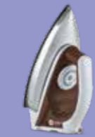
750W Metal Body