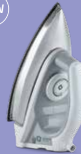
1000W Metal Body