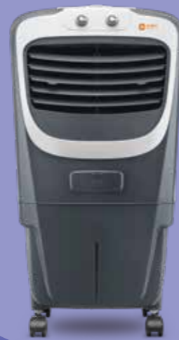
PREMIA 26, 36, 45 CP4501H, CP3602H, CP2601H