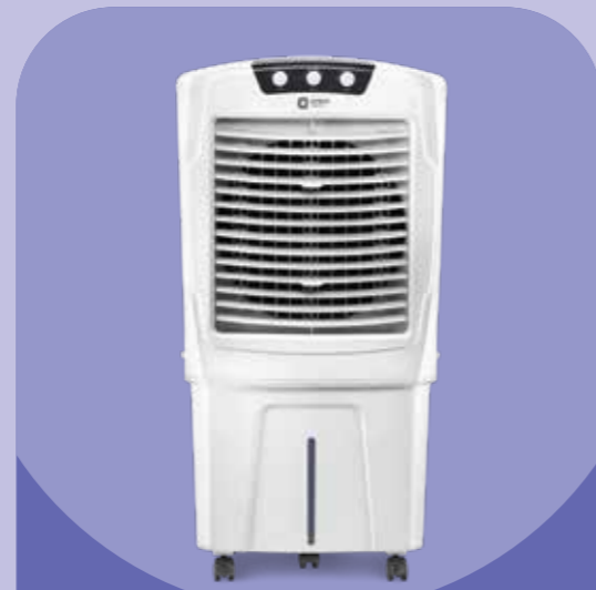
AEROSTORM 92 & 71 CD9201H, CD7101H