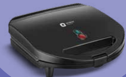
CHEFSPECIAL SANDWICH MAKER SMCS75B2 | 750W