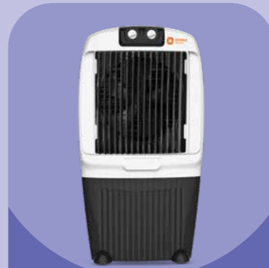
OCEAN AIR 70 CD7001H