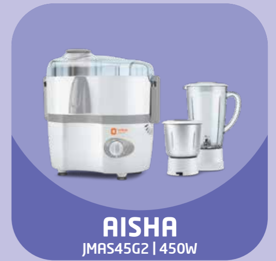
AISHA JMAS45G2 | 450W

Additional Jar (0.4L), Dry/Wet Jar (0.8L), Liquidising Jar (1.5L)