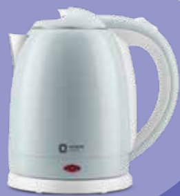
INSTAHOT KETTLE EKIH15BP | 1500W