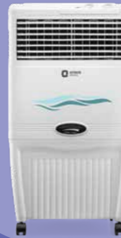
AEROCOOL DX 34 CP3401H