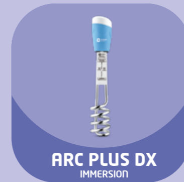
ARC PLUS DX IMMERSION