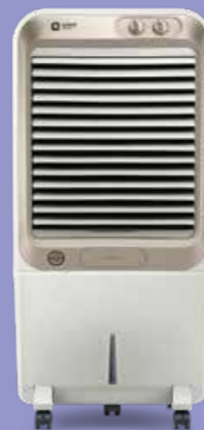
KNIGHT + 70 CD7007H