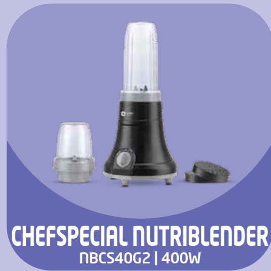
CHEFSPECIAL NUTRIBLENDER NBCS40G2 | 400W