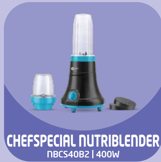
CHEFSPECIAL NUTRIBLENDER NBCS40B2 | 400W