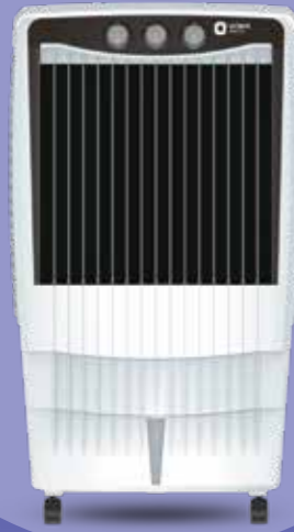
SNOWBREEZE MAGNUS 85 CD8501H