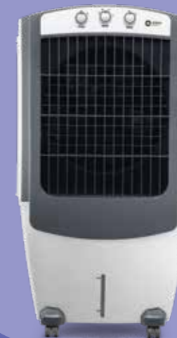
TITAN 75 & 100 CD7501H, CD1002H