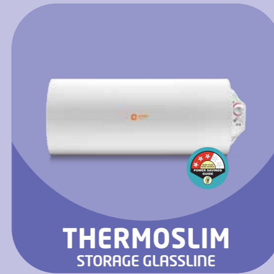
THERMOSLIM STORAGE GLASSLINE