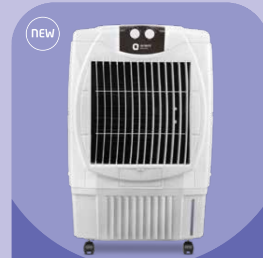
AEROCHILL 100 & 51 CD1001H, CD5101B, CD5102H