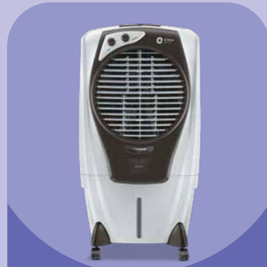
SNOWBREEZE SLIM 66 & 55 CD6601H, CD5501H