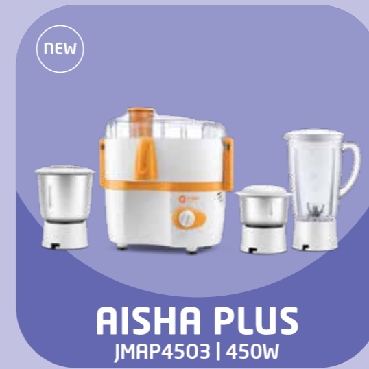
AISHA PLUS JMAP4503 | 450W