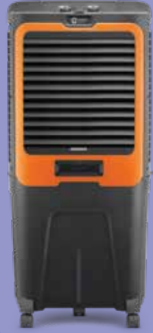
ULTIMO 88 & 50 CD8803H, CD5003H, CD5006HIT