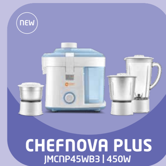
CHEFNOVA PLUS JMCNP45WB3 | 450W