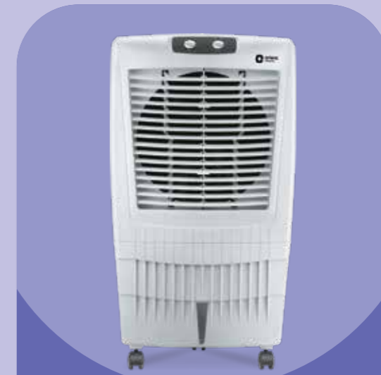
SNOWBREEZE MAGNUS NEO 85 CD8502H