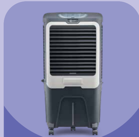
ULTIMO 65 CD6501H, CD6503HI, CD6502HR, CD6506HIT