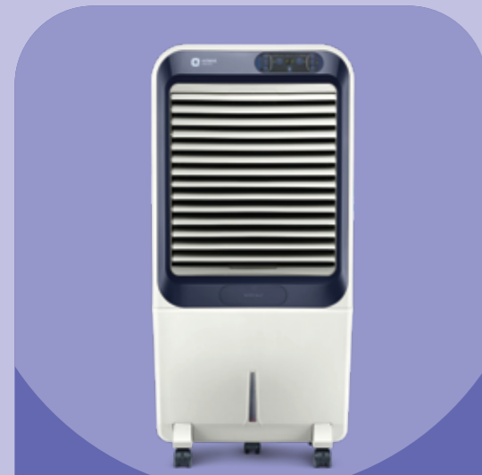
KNIGHT 70 CD7002HR, CD7003H, CD7005HI, CD7006HIT