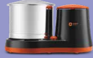
GRIND POWER WGGP152B | 150W