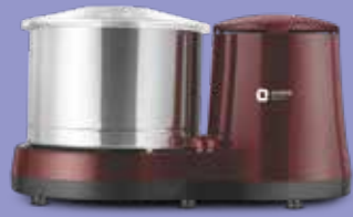
GRIND MASTER WGGM152N | 150W