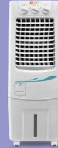
SUPERCool 30 CP3001H