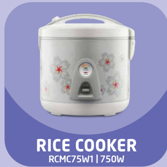
RICE COOKER RCMC75W1 | 750W