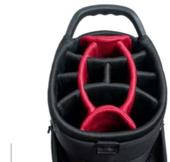
14-WAY DIVIDER TOP