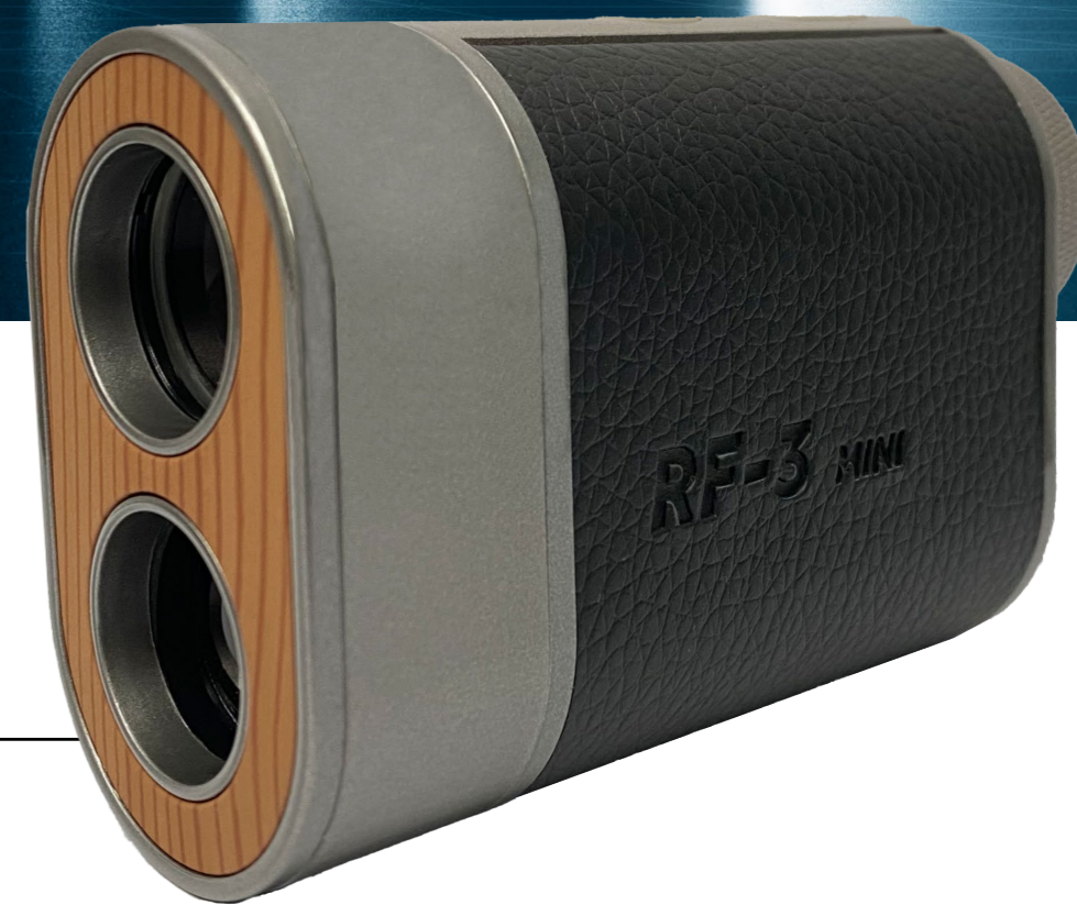
STINGER RF-3 MINI GOLF RANGEFINDER

The RF-1 Slope is a high quality, light weight rangefinder that gives you the latest and greatest features, without the expensive price tag. With a built in rechargeable lithium battery, The RF-1 Slope is ready to help you improve your golf game from tee to green.