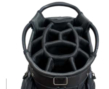
14-WAY DIVIDER TOP