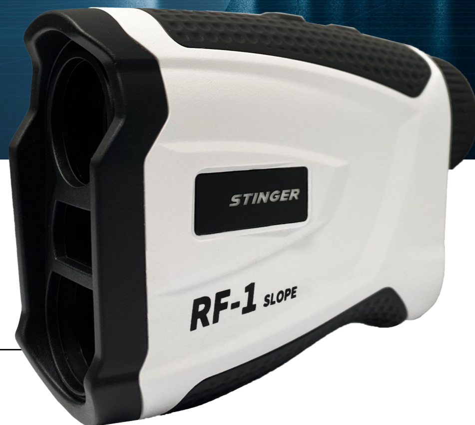
STINGER RF-1 GOLF RANGEFINDER

The RF-1 Slope is a high quality, light weight rangefinder that gives you the latest and greatest features, without the expensive price tag. With a built in rechargeable lithium battery, The RF-1 Slope is ready to help you improve your golf game from tee to green.