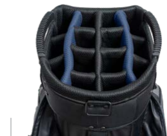
14-WAY DIVIDER TOP