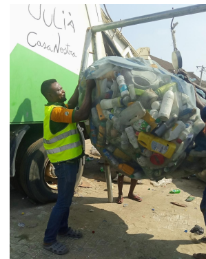
Weighing a batch of collected plastic materials at Trashusers facility in Ibeju Lekki

Note: Information is subject to change according to local conditions.