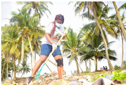
Collection of marine litter at Iwerekun Beach, Lagos, Nigeria

Trashusers contributes to reverse the plastic pollution while promoting social economic. Their intention is to promote circular economy, create job opportunities, educate and raise awareness about the problem and solutions of plastic waste. They do this through their daily operation of plastic collection, in addition to campaigns such as school awareness programs. The support they receive through Empower's Plastic Credits Program goes to increasing the salary of their waste pickers and to acquire equipment to collect further volumes. Trashusers LinkedIn page.