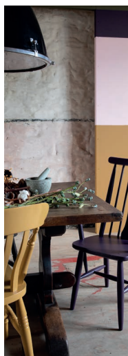
TAILORED TWEED / BERRY INK / SATIN