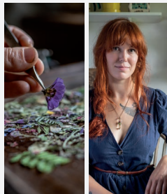
KHRYSTYNA MARRIOTT / RARITY