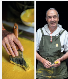
MARTIN WRIGHT / DANCING LIGHT