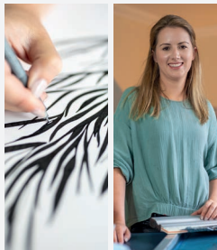
LAURA WILKINSON / LINE ART