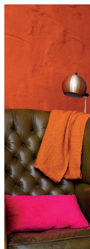
RUSTLING LEAVES / ENHANCED MATT