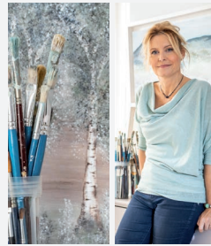
ELAINE TOMLIN / WOODLAND LIGHT