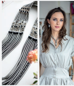
BLAITINN ENNIS / WHIMISICAL