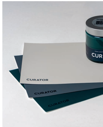
/ REAL PAINT A5 PANELS / 3 OZ TESTER POTS