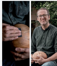
MATT JONES / PARING DOWN