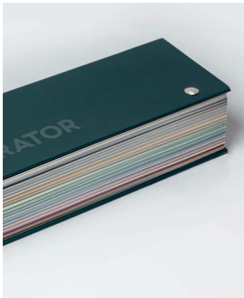
/ REAL PAINT FANDECK