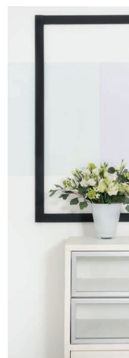
CLARITY / SLIP GLAZE / COBWEB / ENHANCED MATT

Our palette is a carefully curated selection of 144 colours, designed and flowed for all the colours to work intrinsically with each other.