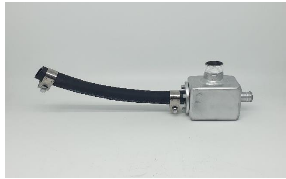
Sand Flow Cube Upgrade Kit