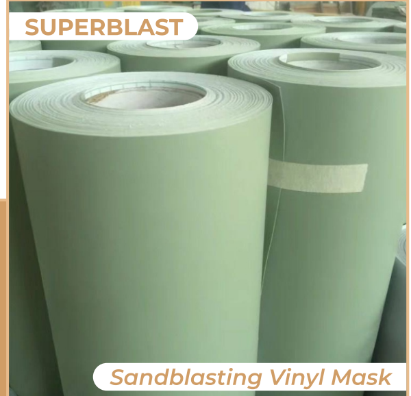
Sandblasting Vinyl Mask