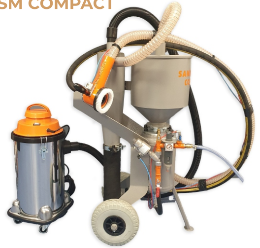
Mobile Dustless System