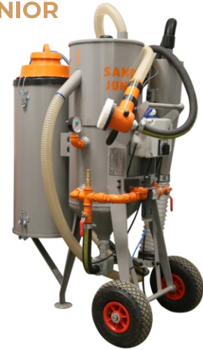
Portable Dustless System