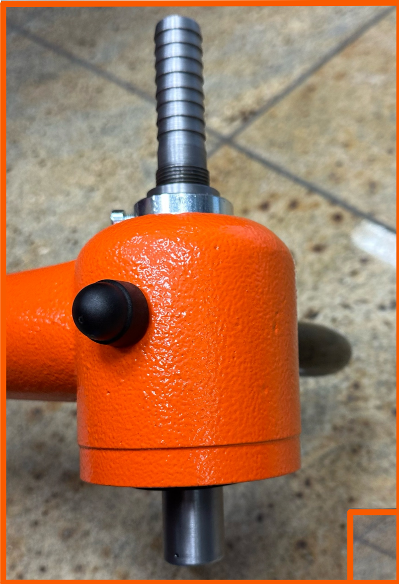
Head with fastening inside