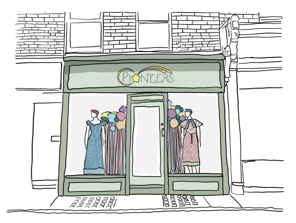
76 MARYLEBONE LANE, LUNDON, WILL 2PR

Everything is made by London based ateliers in small runs. All knitwear is hand-knitted by a small team of UK based home knitters and the brand works with local patchworkers and embroidery artists for special projects.