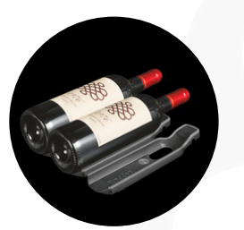
Main du sommelier