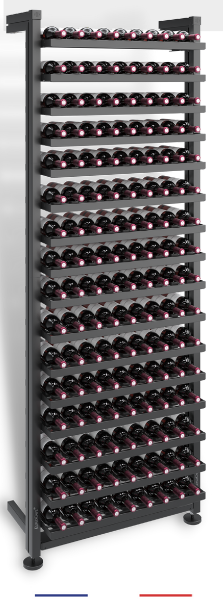
Manufacturé en France

No matter what room you want to create, we will find the solution that will bring your passion to life.