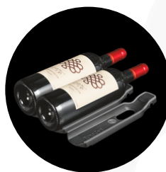
Main du sommelier