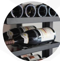
Capacity of 42 bottles type bordeaux tradition*