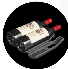
Main du sommelier